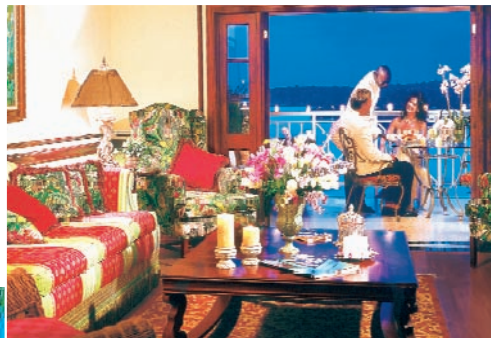
Royal Oceanfront 1 Br. Suite

So plan your group meeting or incentive trip to Royal Plantation Golf Resort & Spa —a tropical hideaway in one of the most enchanting places on earth.