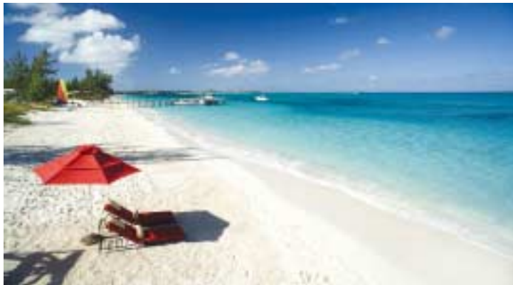
Grace Bay Beach

*Resort course available at an additional charge. **Spa services additional.