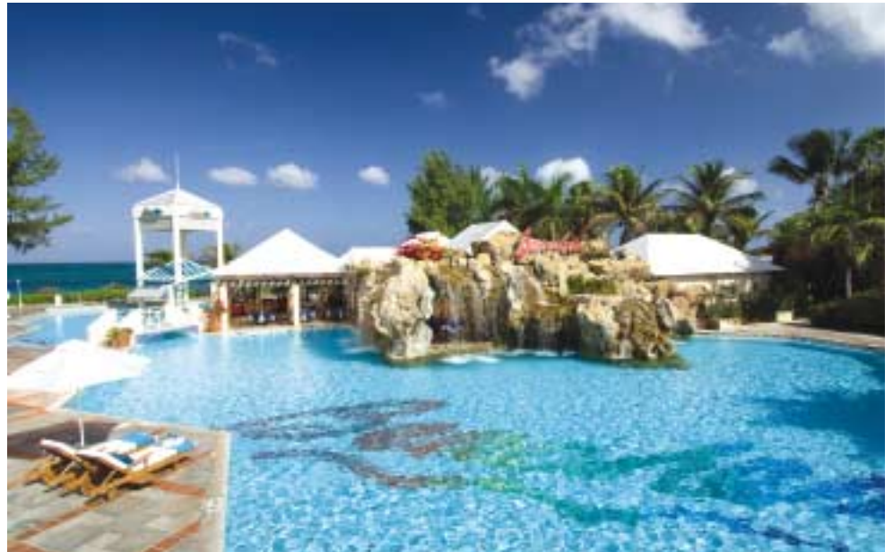
Cascades Pool & Swim-Up Pool Bar

Beaches RESORTS by Sandals TURKS & CAICOS • JAMAICA