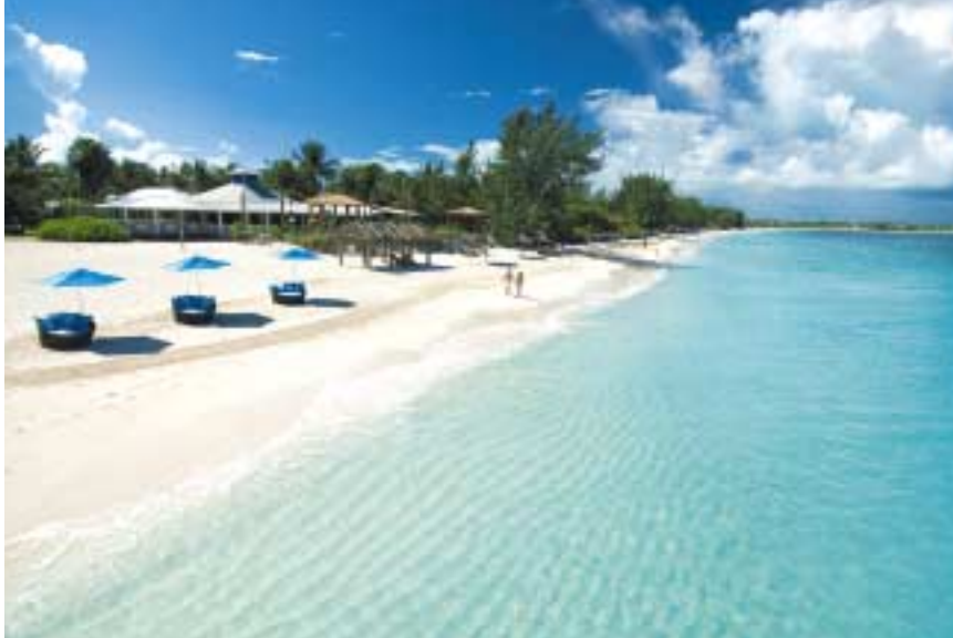
12 Miles of Pristine White-Sand Beach