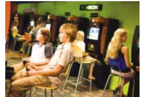
Xbox 360® Game Garage