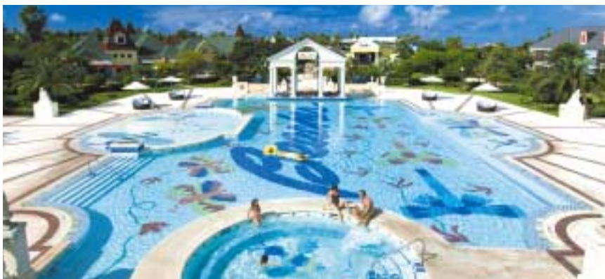
French Village Pool

Your group will enjoy the ultimate getaway at Beaches Turks & Caicos Resort & Spa, where pastel bungalows sit amidst manicured gardens, surrounded by 12 miles of pristine white-sand beaches swept by balmy island breezes.