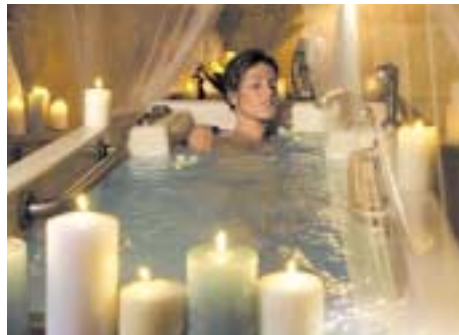
Full-Service Red Lane® Spa