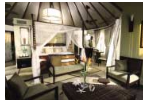
The Ultra Luxury Rondoval Suite