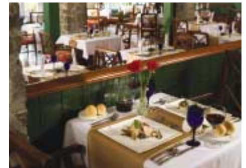
5-Star Diamond-Rated Toscanini's Italian Restaurant