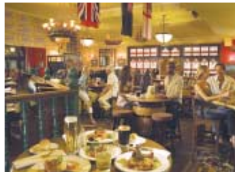
Authentic English Pub