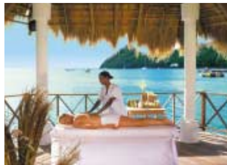
Full-Service Red Lane® Spa