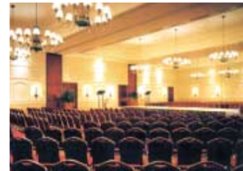
Spacious Meeting Facilities