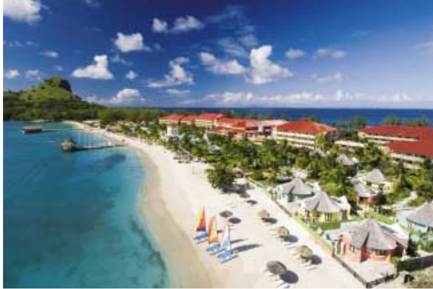
Sandals Grande St. Lucian surrounds you with the grandest views from sea to shining sea.