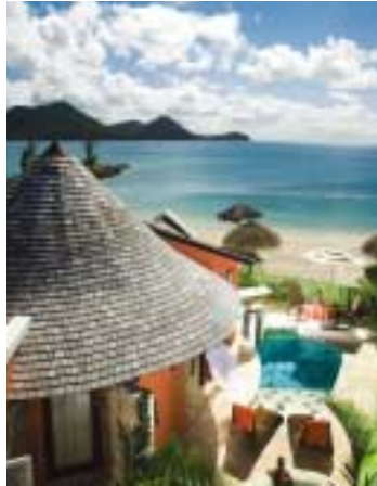
Rondovals — unique seaside villas in the round