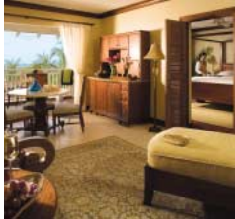
Prime Minister's One Bedroom Beachfront Luxury Suite