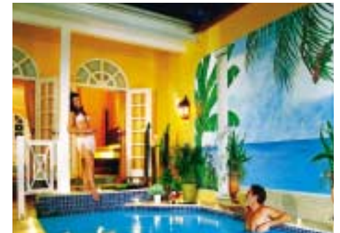
Romeo & Juliet One-bedroom Suite With Private Pool