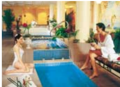
Full-Service Red Lane® Spa