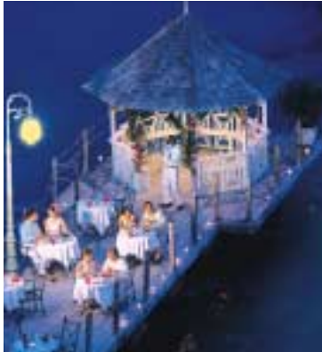
Dining At The Pier