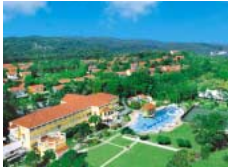
The Manor House

Capacity for up to 1,400 persons, AV equipment available.