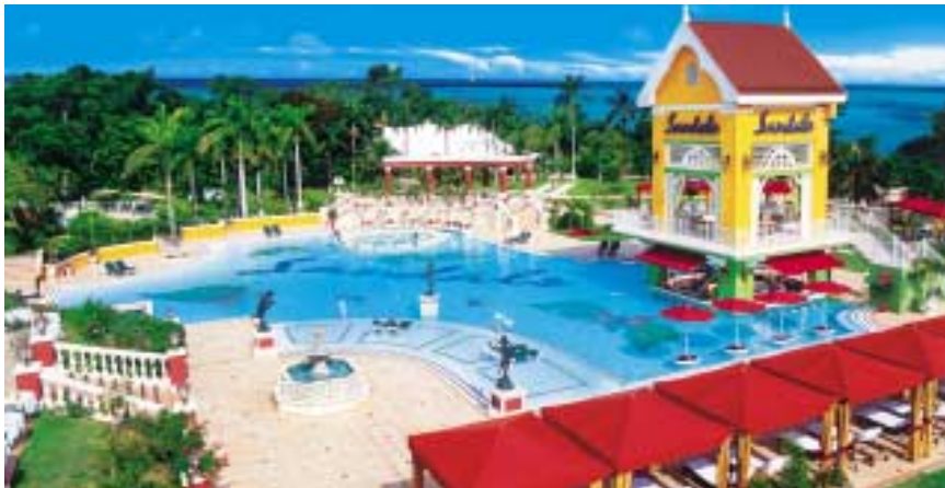
Manor Pool With Its Towering Swim-up Bar