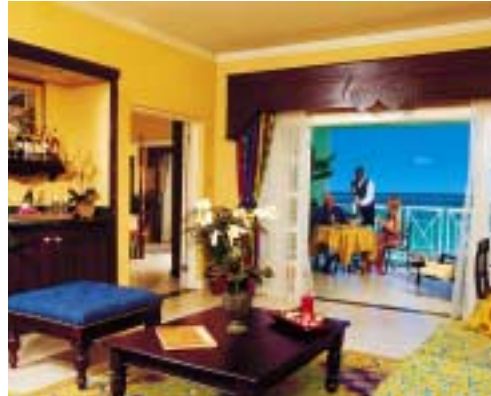
Honeymoon Riviera Oceanfront One Bedroom Luxury Suite