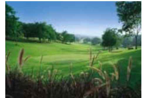
Golf Available at Sandals Golf & Country Club