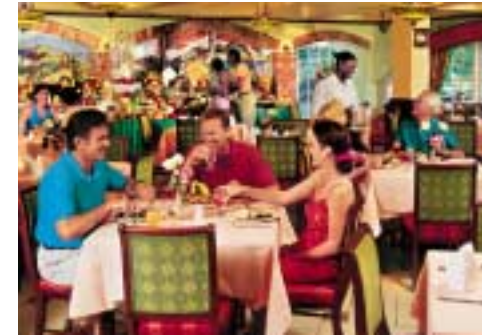
The Market Place Restaurant