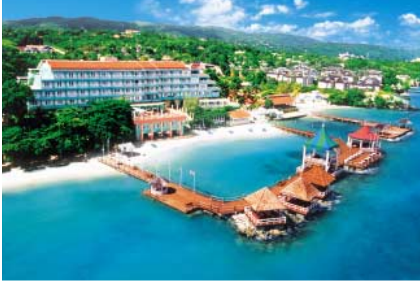
Sandals Grande Ocho Rios Is A Veritable Garden of Eden