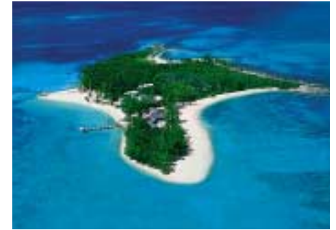
Sandals Cay — Private Offshore Island