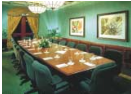
The Convention Center's Executive Boardroom