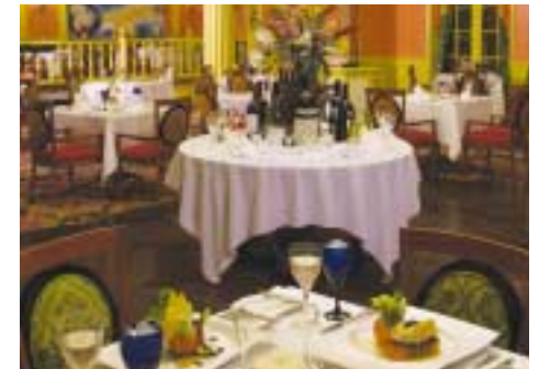
Crystal Room Restaurant