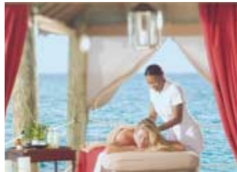
Full-service Red Lane® Spa Voted The Caribbean's Best by the readers of Condé Nast Traveler