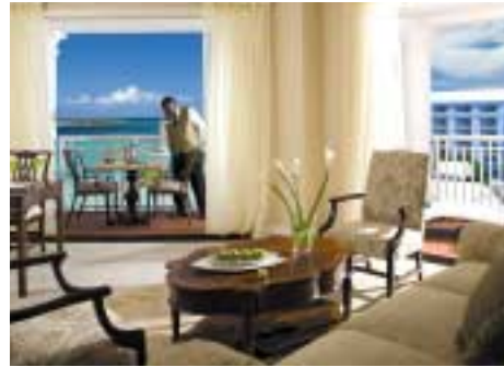
Royal Windsor Beachfront One Bedroom Suite

Capacity: 8,900 sq. ft of conference facility space with AV equipment.