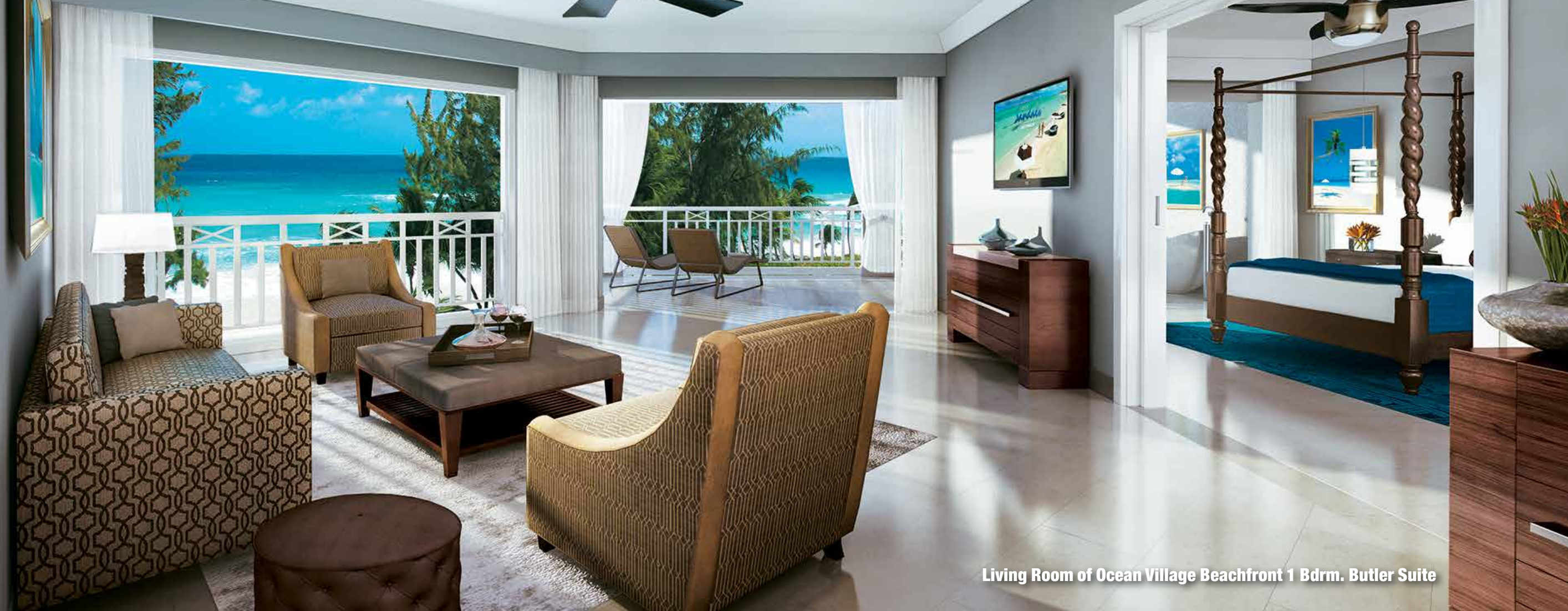
Living Room of Ocean Village Beachfront 1 Bdrm. Butler Suite

The sumptuously appointed rooms and suites of the Ocean Village have a mesmerizing vista of the Caribbean Sea boasting a thousand shades of blue. Sandals Barbados offers a selection of 280 luxury accommodations that include this opulent suite with Butler Elite service, a balcony Tranquility Soaking Tub, a spacious living room, and a separate bedroom with a magnificent en-suite bathroom.