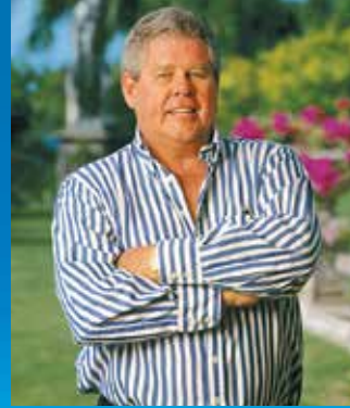
GORDON "BUTCH" STEWART Chairman, Sandals Resorts

Creating a five-star luxury experience for our guests begins with inspired design. As always, we continue to push beyond the boundaries of innovative architecture to deliver a product that is decidedly indulgent, undeniably luxurious, and unmistakably Sandals. When we go into a new destination, we find inspiration from the people who live there—always staying true to the culture of the island. I promise you that this resort will be everything you expect from Sandals...and more. Please enjoy this sneak preview...I can't wait for you to see it for yourself!