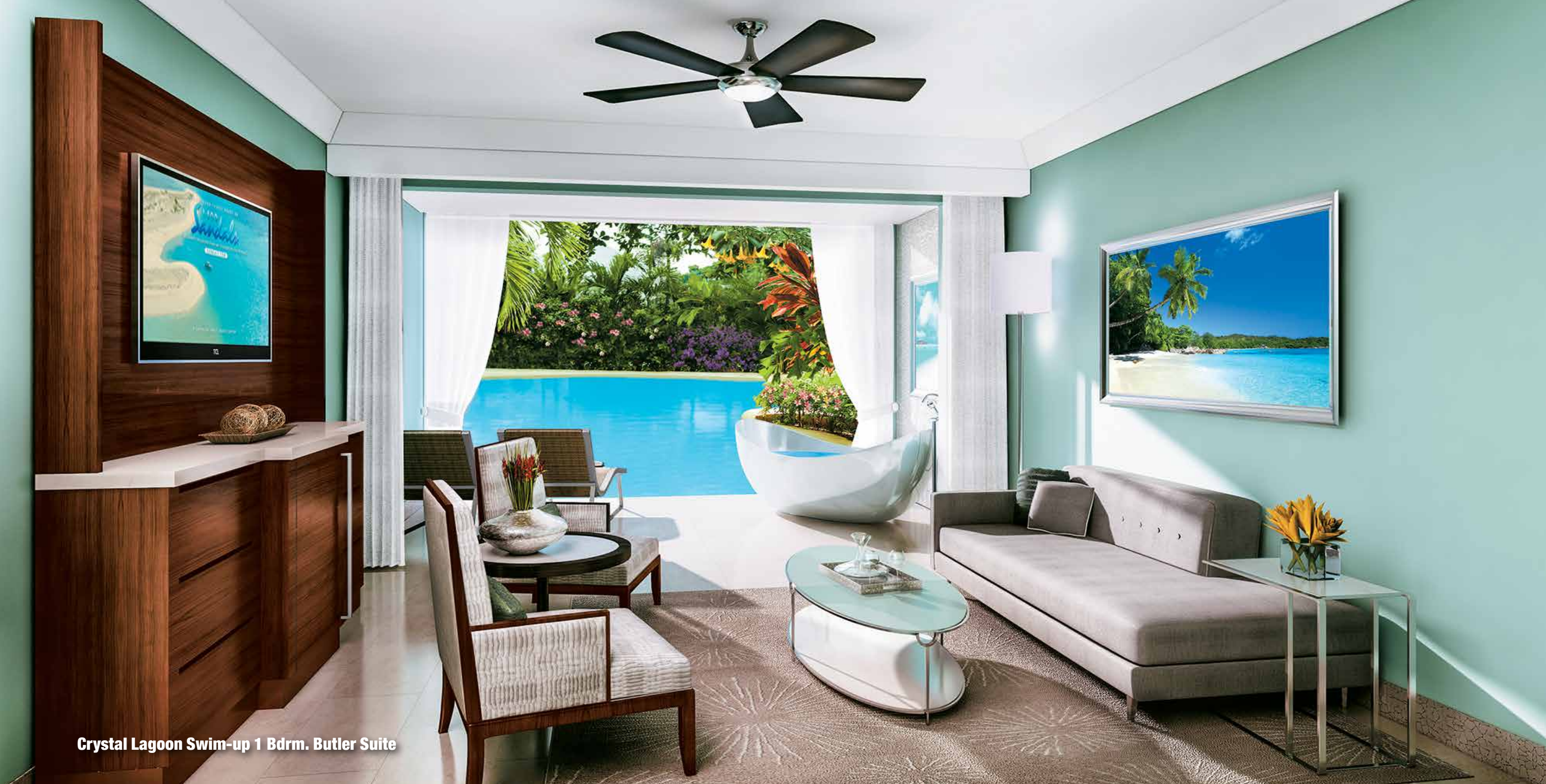
Crystal Lagoon Swim-up 1 Bdrm. Butler Suite