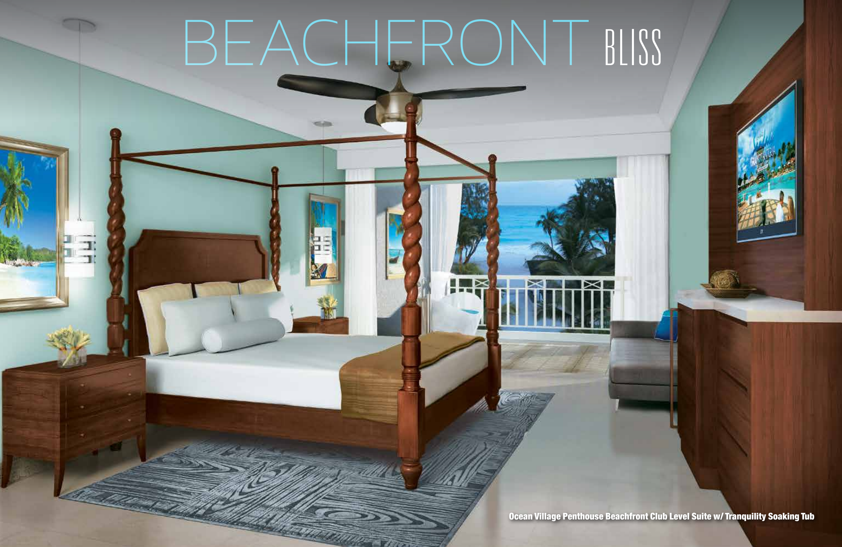
Ocean Village Penthouse Beachfront Club Level Suite w/ Tranquility Soaking Tub