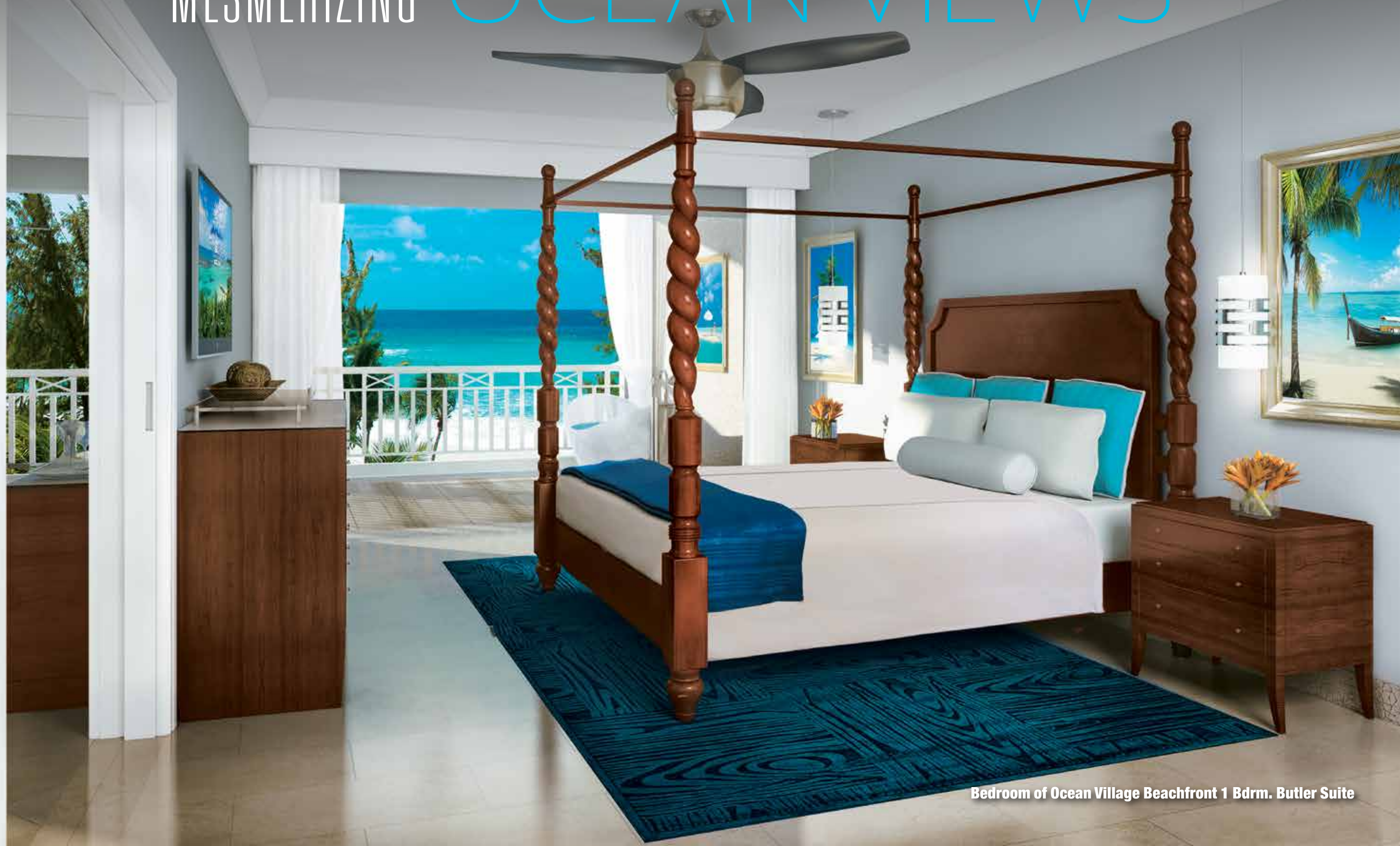
Bedroom of Ocean Village Beachfront 1 Bdrm. Butler Suite