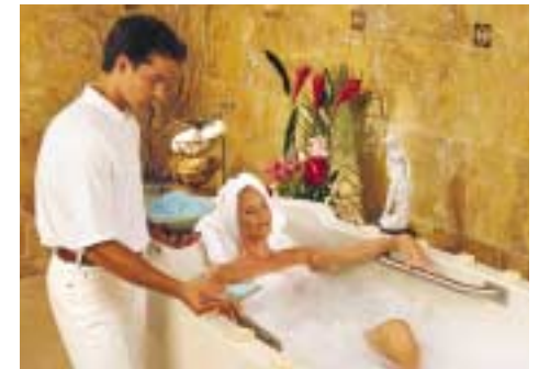
Red Lane ® Spa