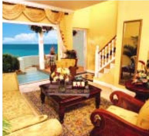
Two-Story Villa Suite on Sunset Ocean Bluff