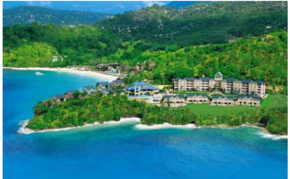
Sunset Ocean Bluff Features 56 Luxurious Suites