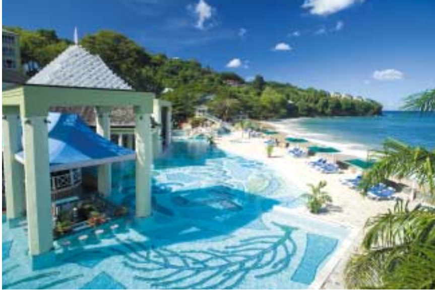
The Resort's Dramatic Main Pool