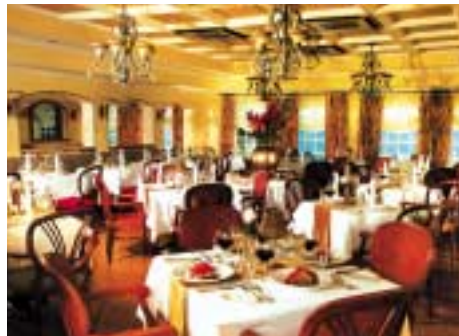
La Toc Restaurant