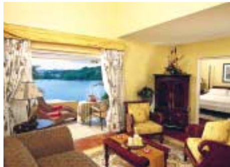
One Bedroom Suite on Sunset Ocean Bluff