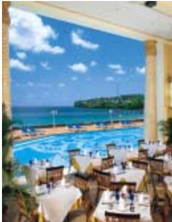
The Pavilion Restaurant