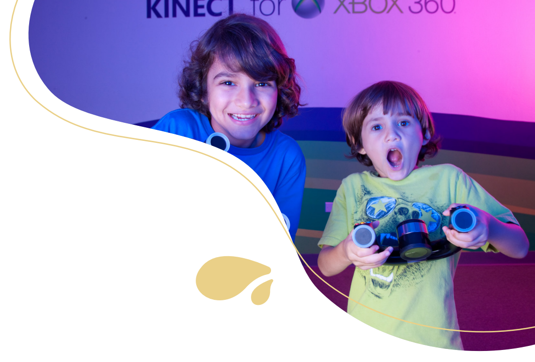
Activities Sensory Level Summary