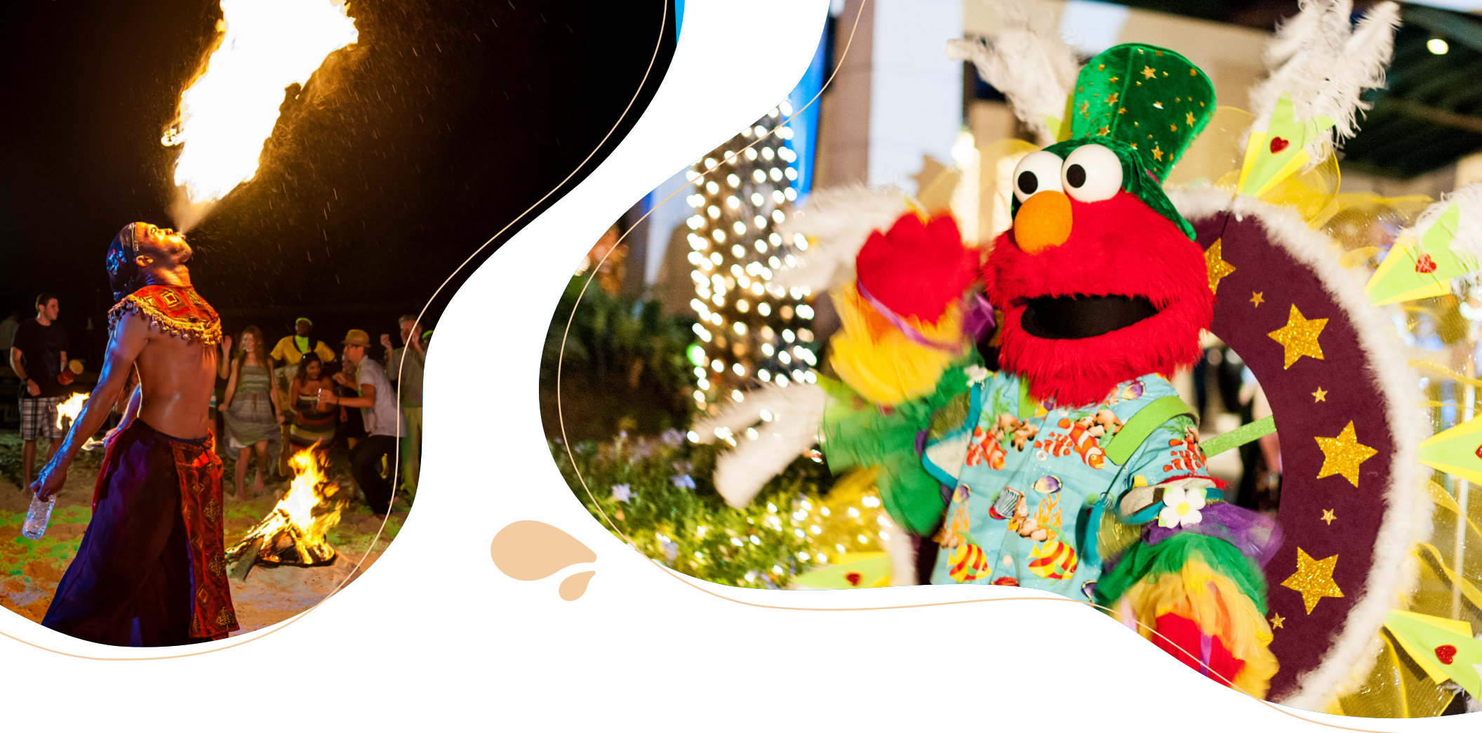
Weekly Events Sensory Level Summary