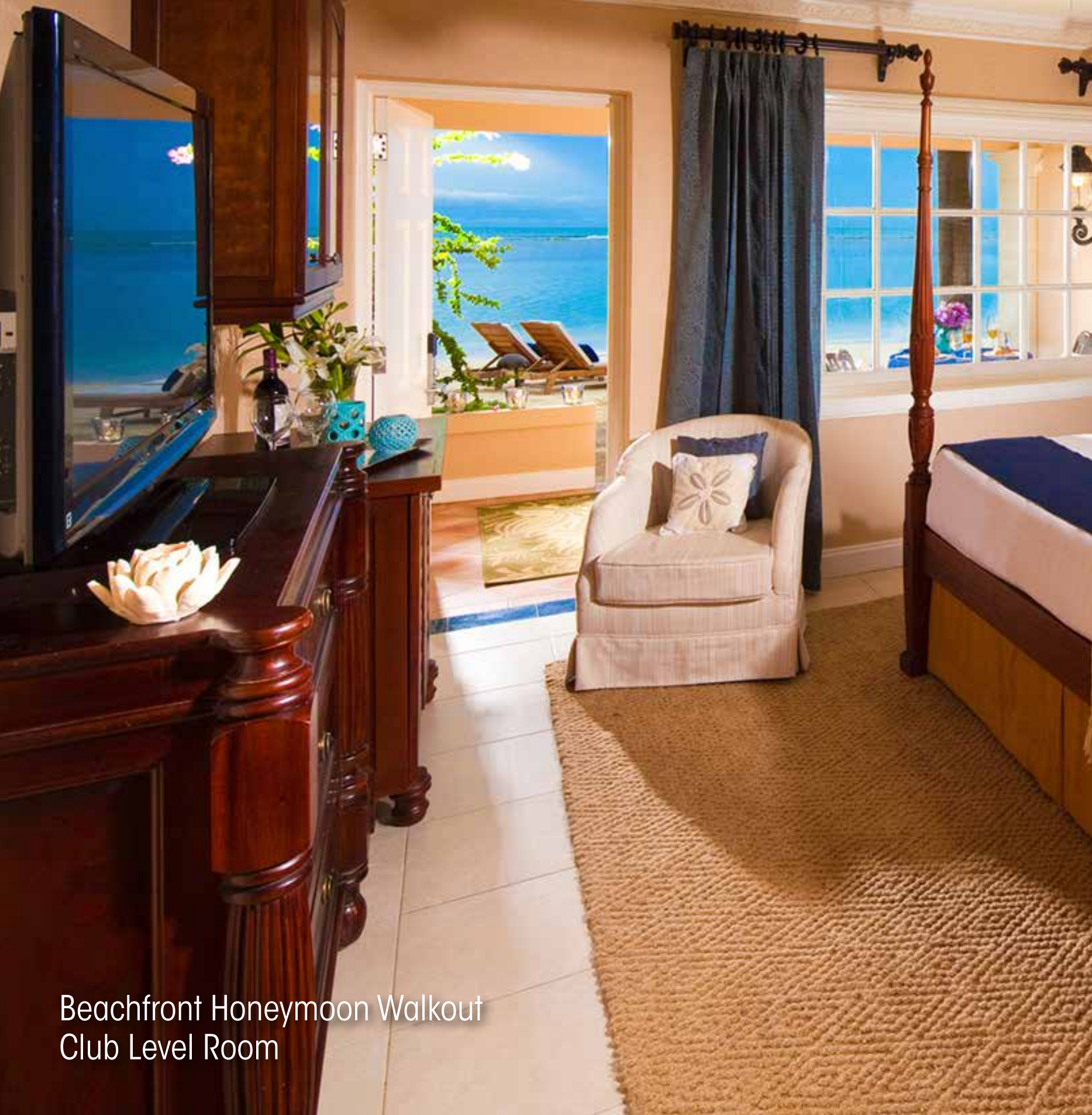
Beachfront Honeymoon Walkout Club Level Room