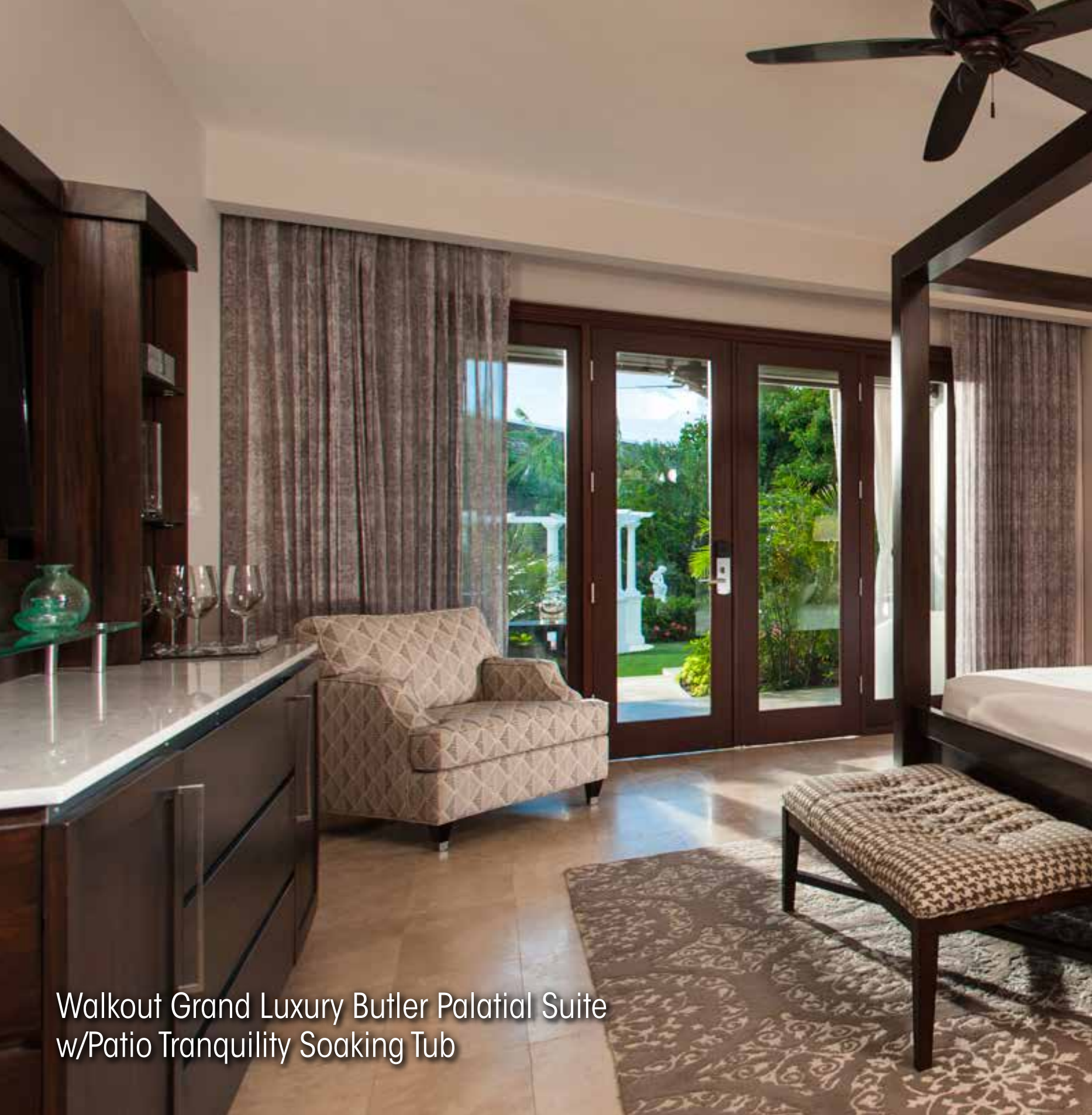
Walkout Grand Luxury Butler Palatial Suite w/Patio Tranquility Soaking Tub