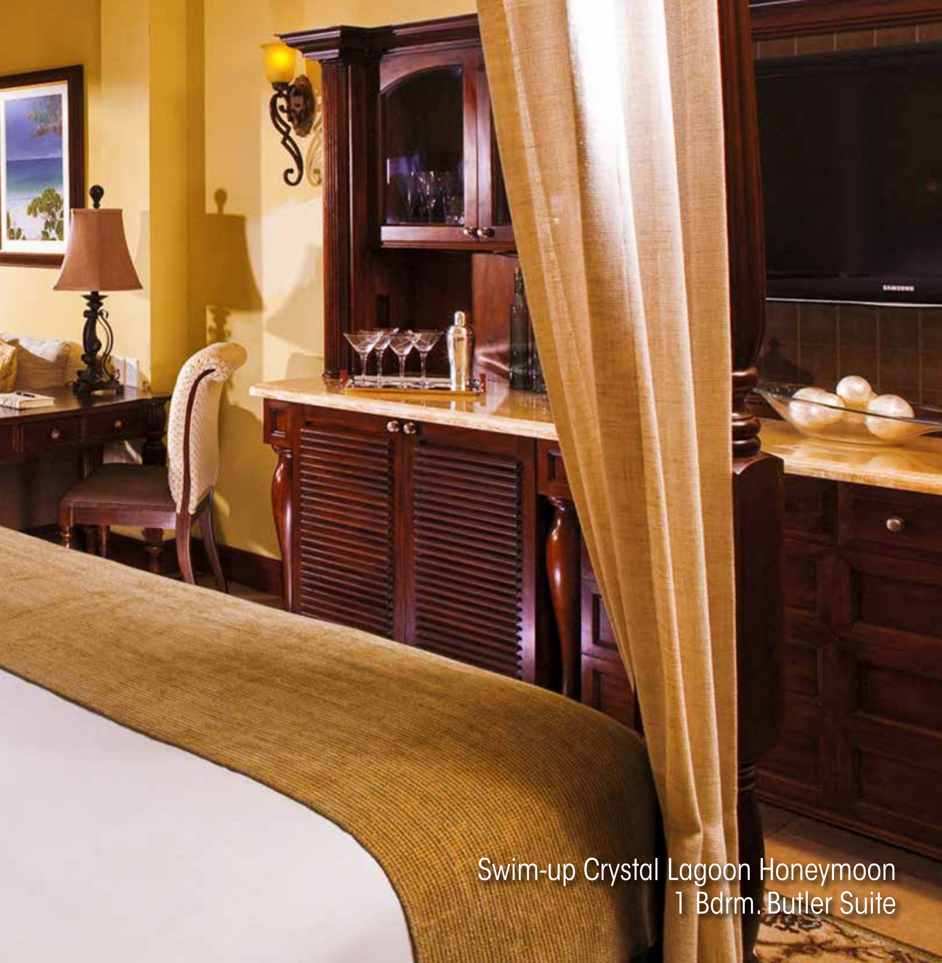
Swim-up Crystal Lagoon Honeymoon 1 Bdrm. Butler Suite