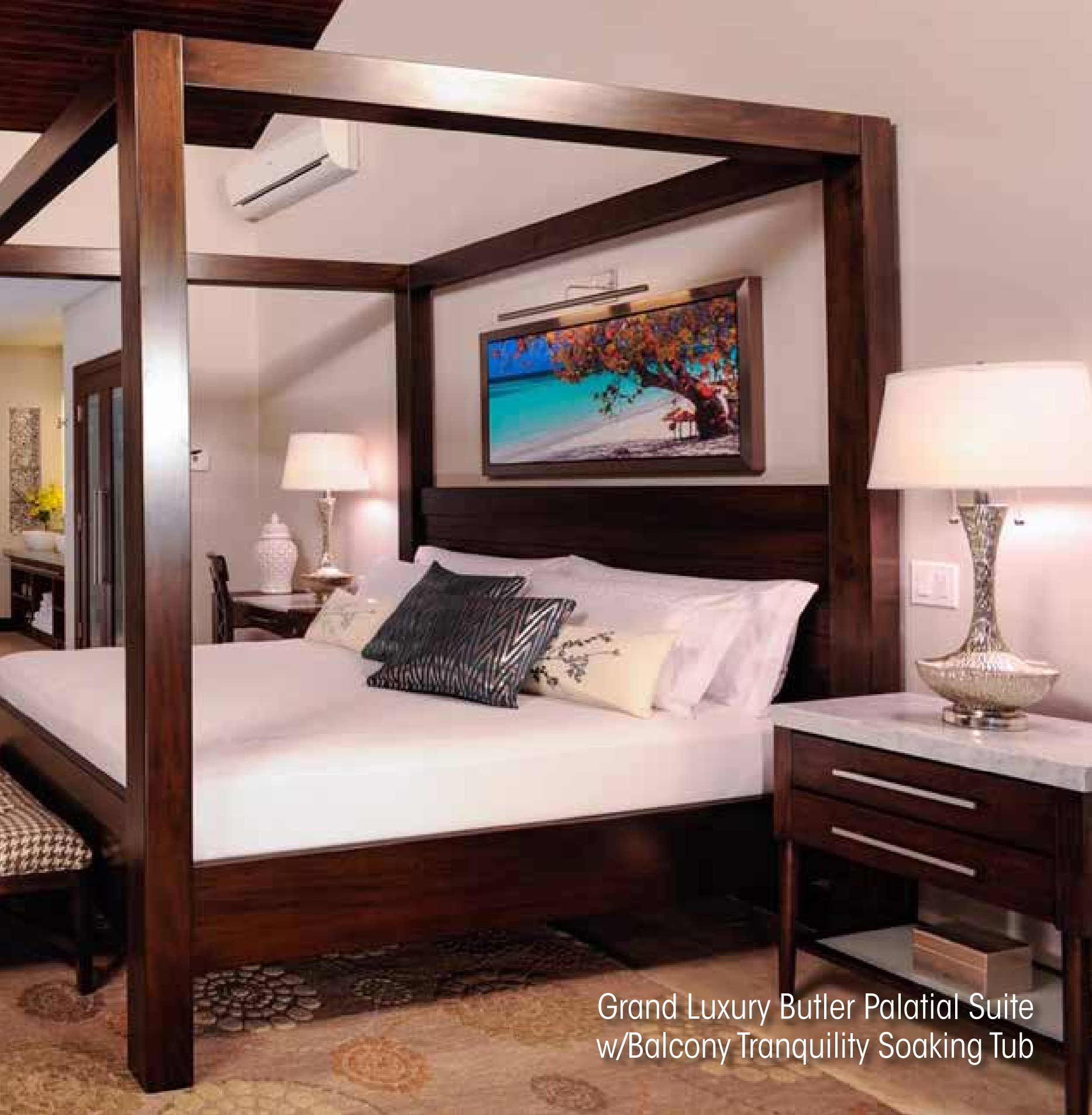
Grand Luxury Butler Palatial Suite w/Balcony Tranquility Soaking Tub