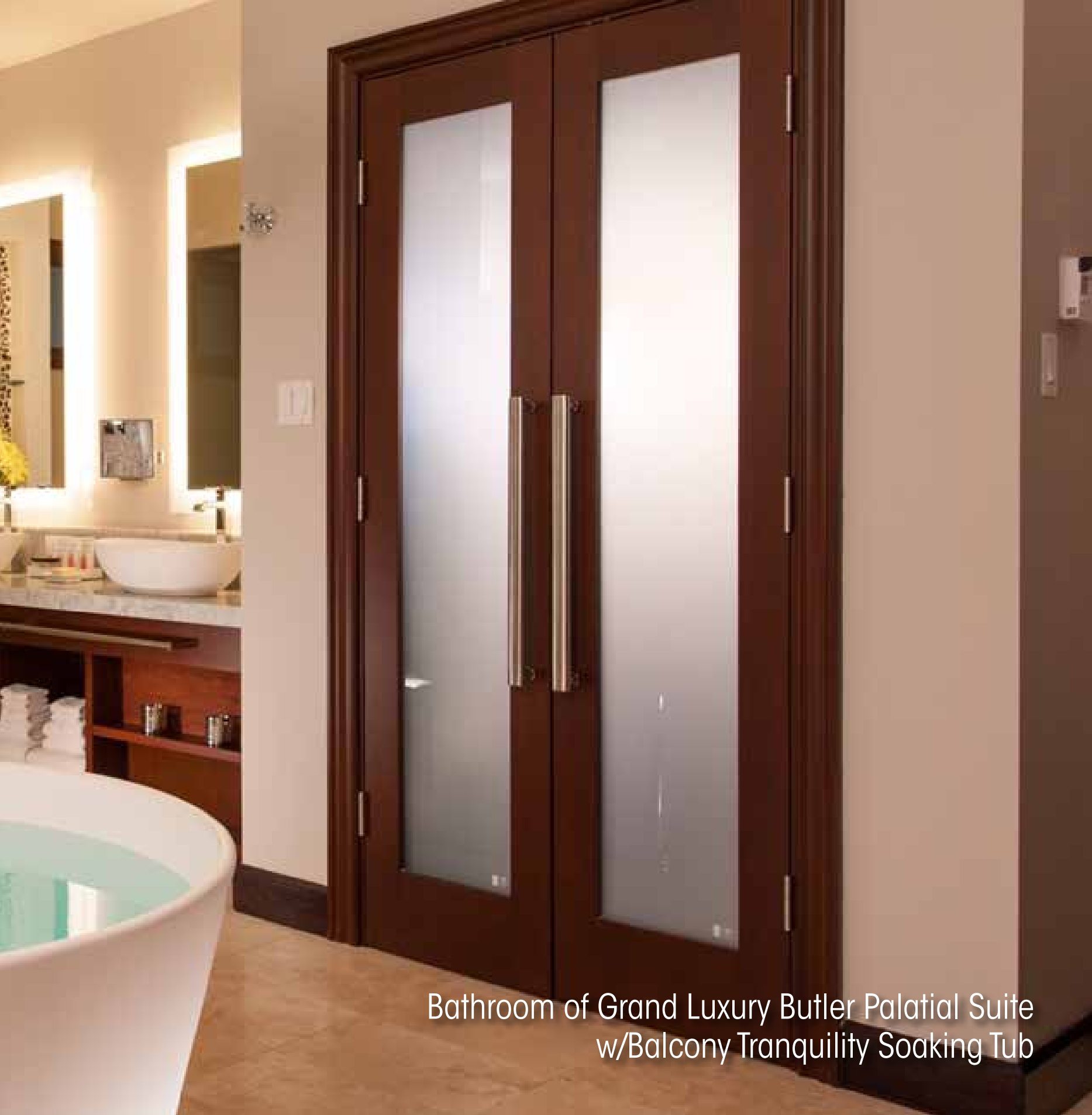
Bathroom of Grand Luxury Butler Palatial Suite w/Balcony Tranquility Soaking Tub