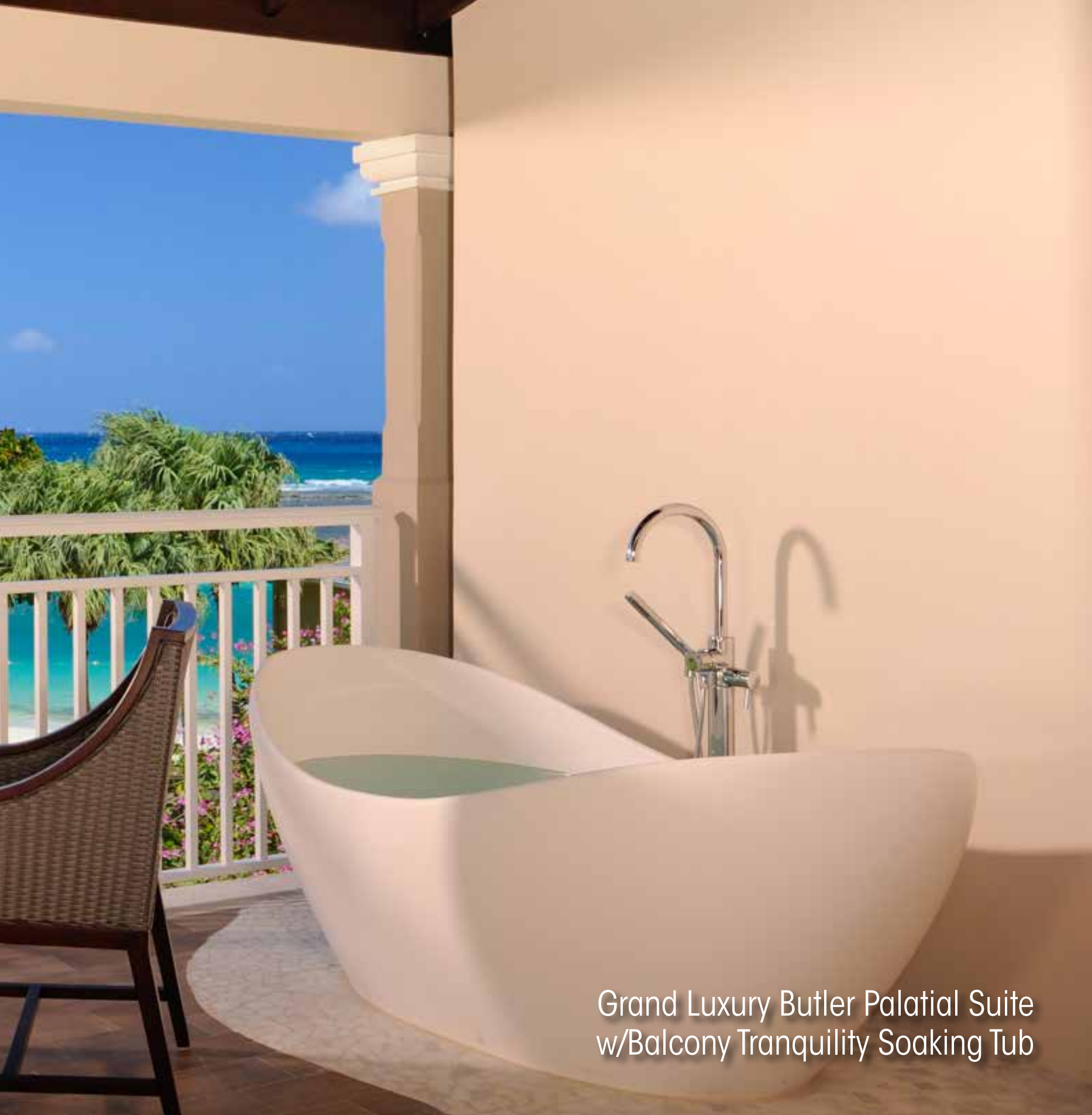
Grand Luxury Butler Palatial Suite w/Balcony Tranquility Soaking Tub