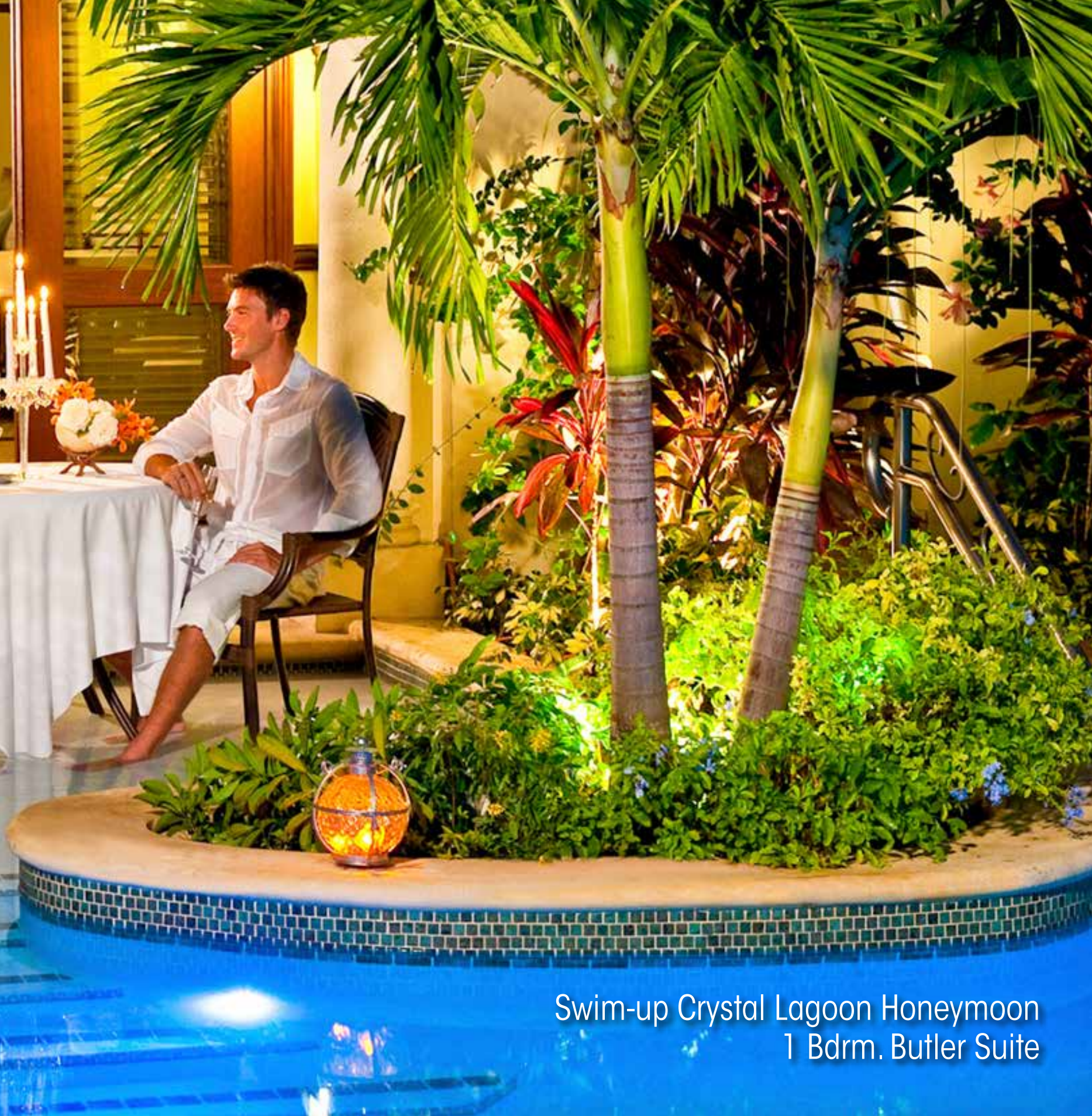
Swim-up Crystal Lagoon Honeymoon 1 Bdrm. Butler Suite