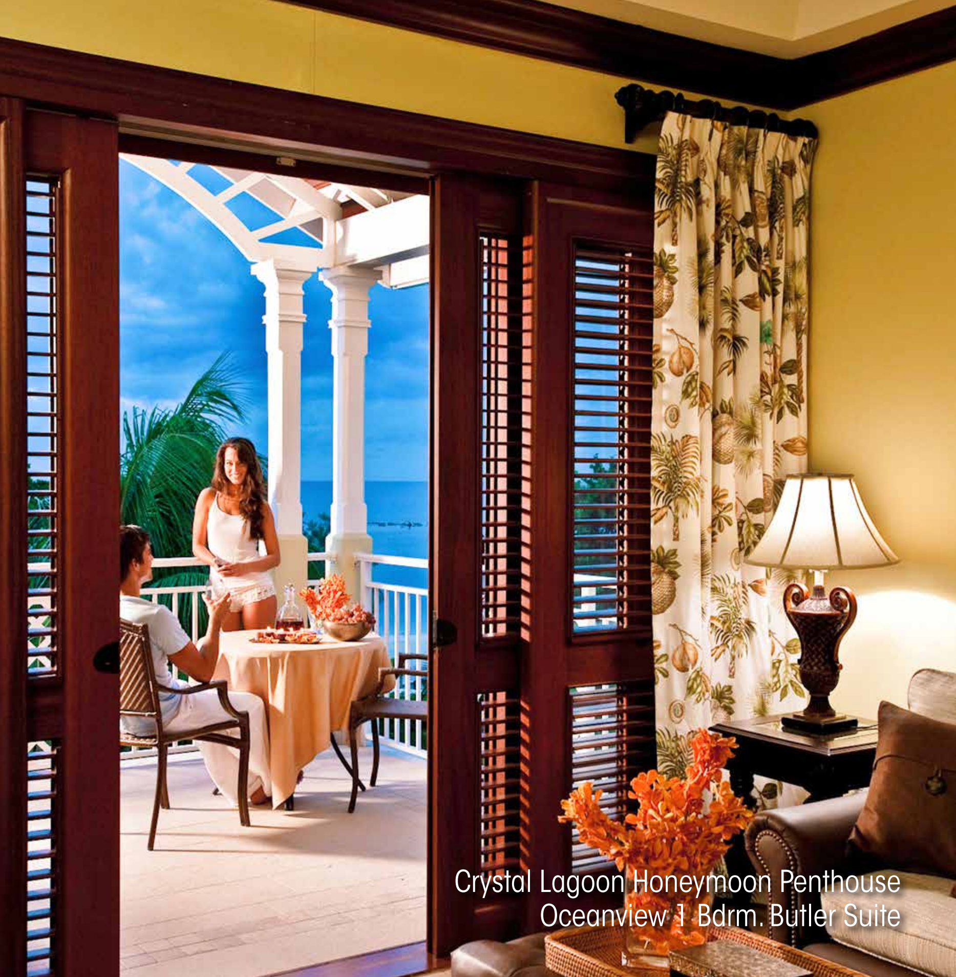
Crystal Lagoon Honeymoon Penthouse Oceanview 1 Bdrm. Butler Suite