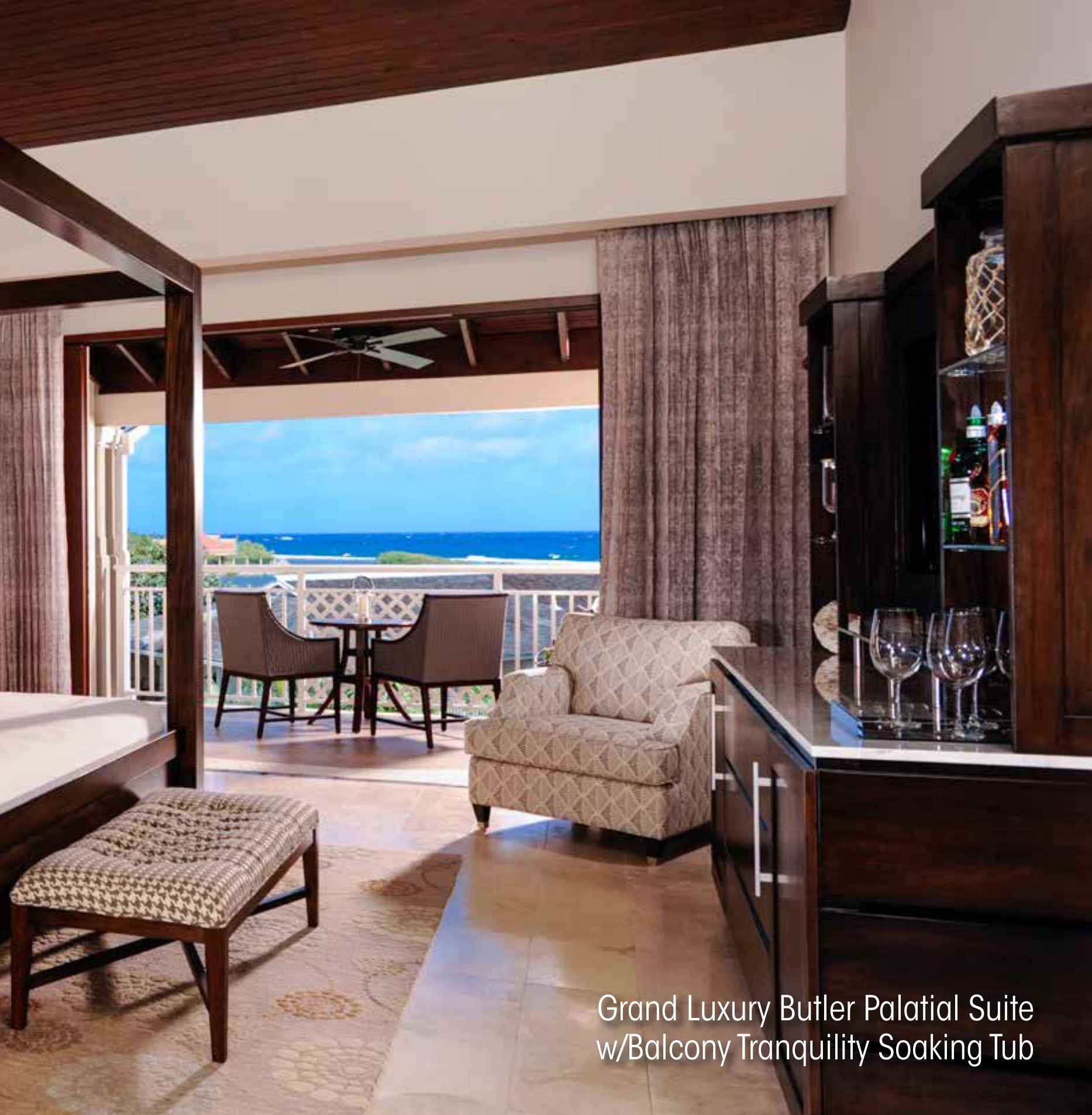
Grand Luxury Butler Palatial Suite w/Balcony Tranquility Soaking Tub