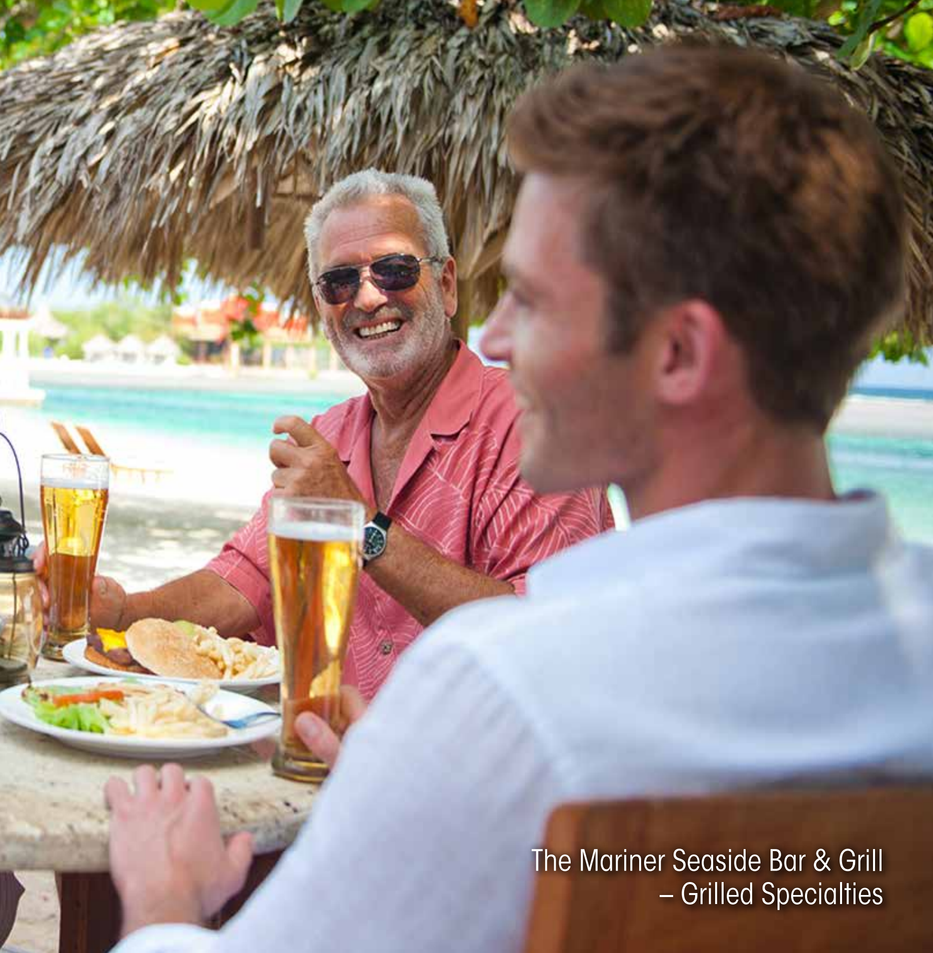
The Mariner Seaside Bar & Grill – Grilled Specialties