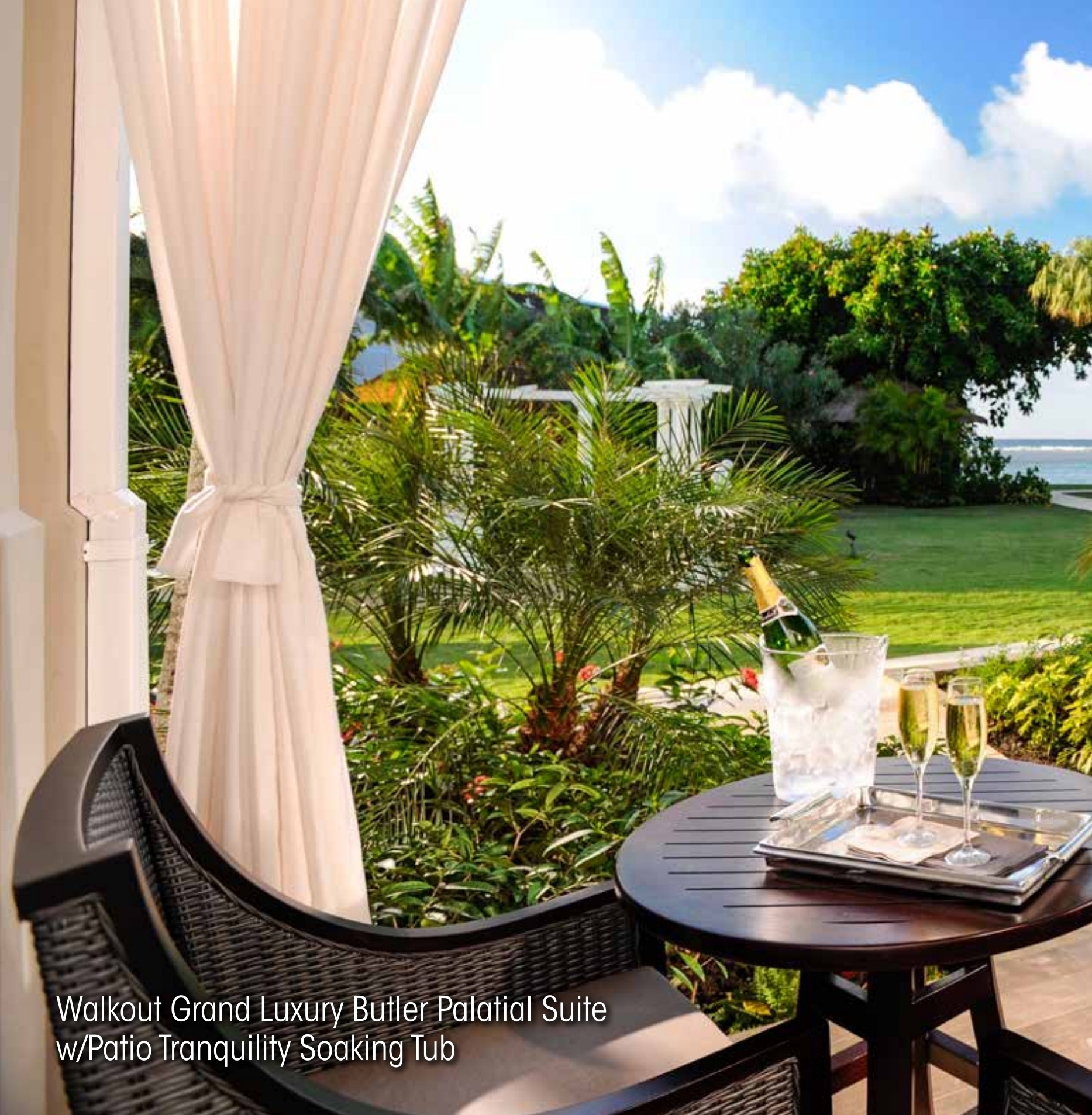
Walkout Grand Luxury Butler Palatial Suite w/Patio Tranquility Soaking Tub