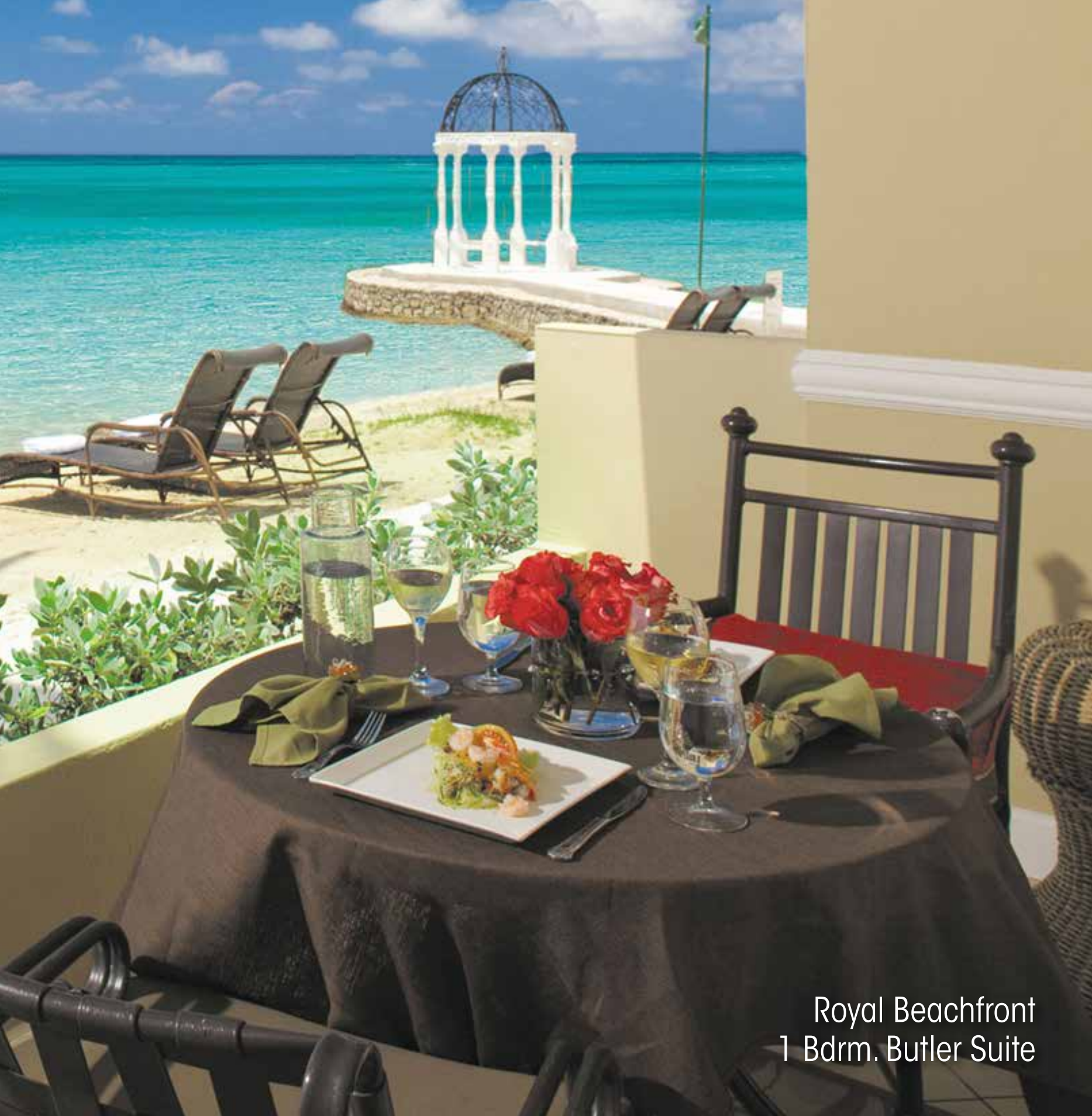
Royal Beachfront 1 Bdrm. Butler Suite