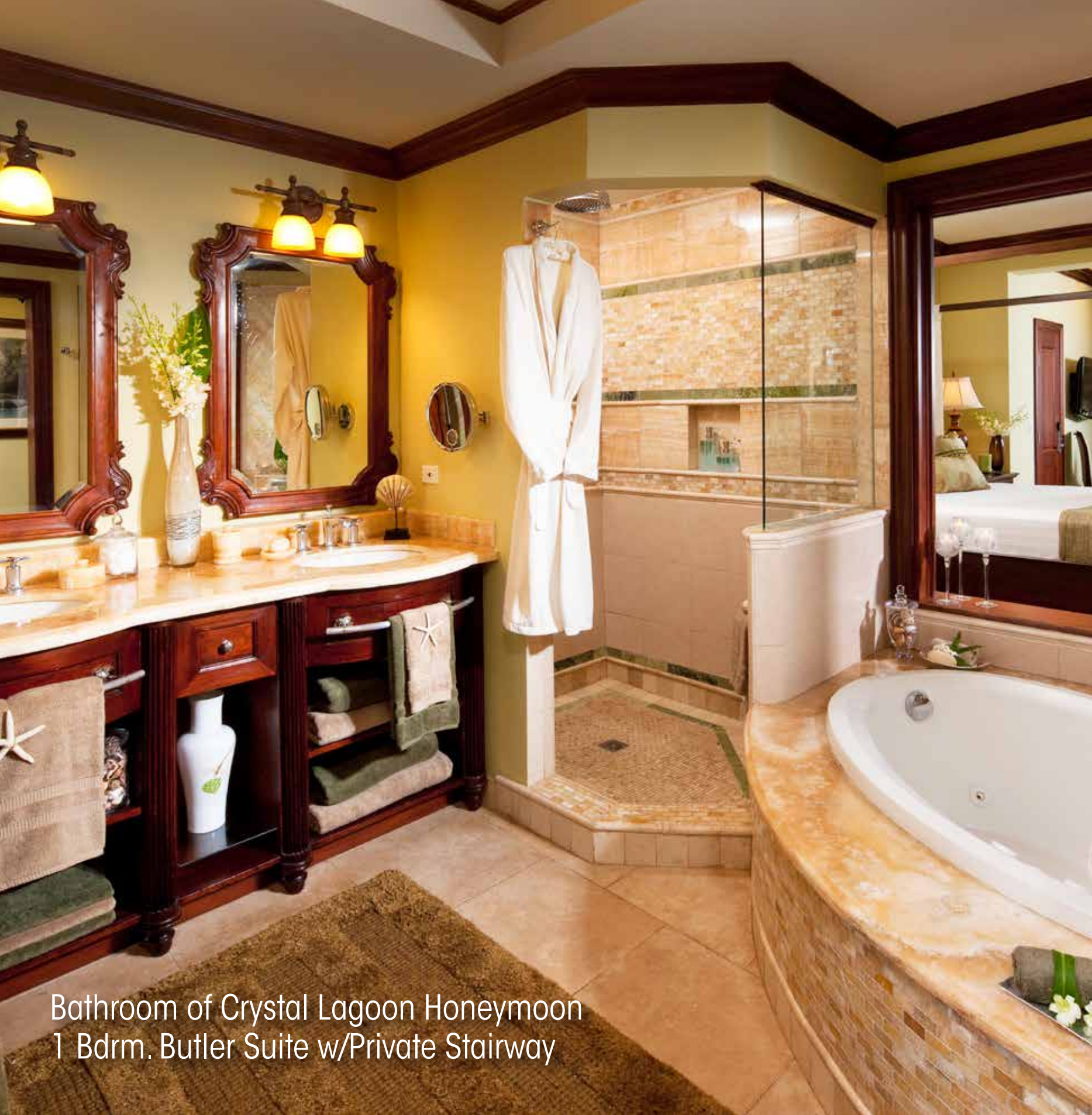
Bathroom of Crystal Lagoon Honeymoon 1 Bdrm. Butler Suite w/Private Stairway