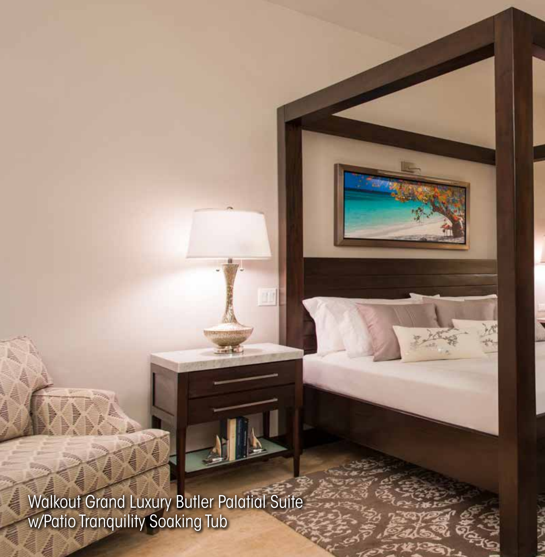
Walkout Grand Luxury Butler Palatial Suite w/Patio Tranquility Soaking Tub