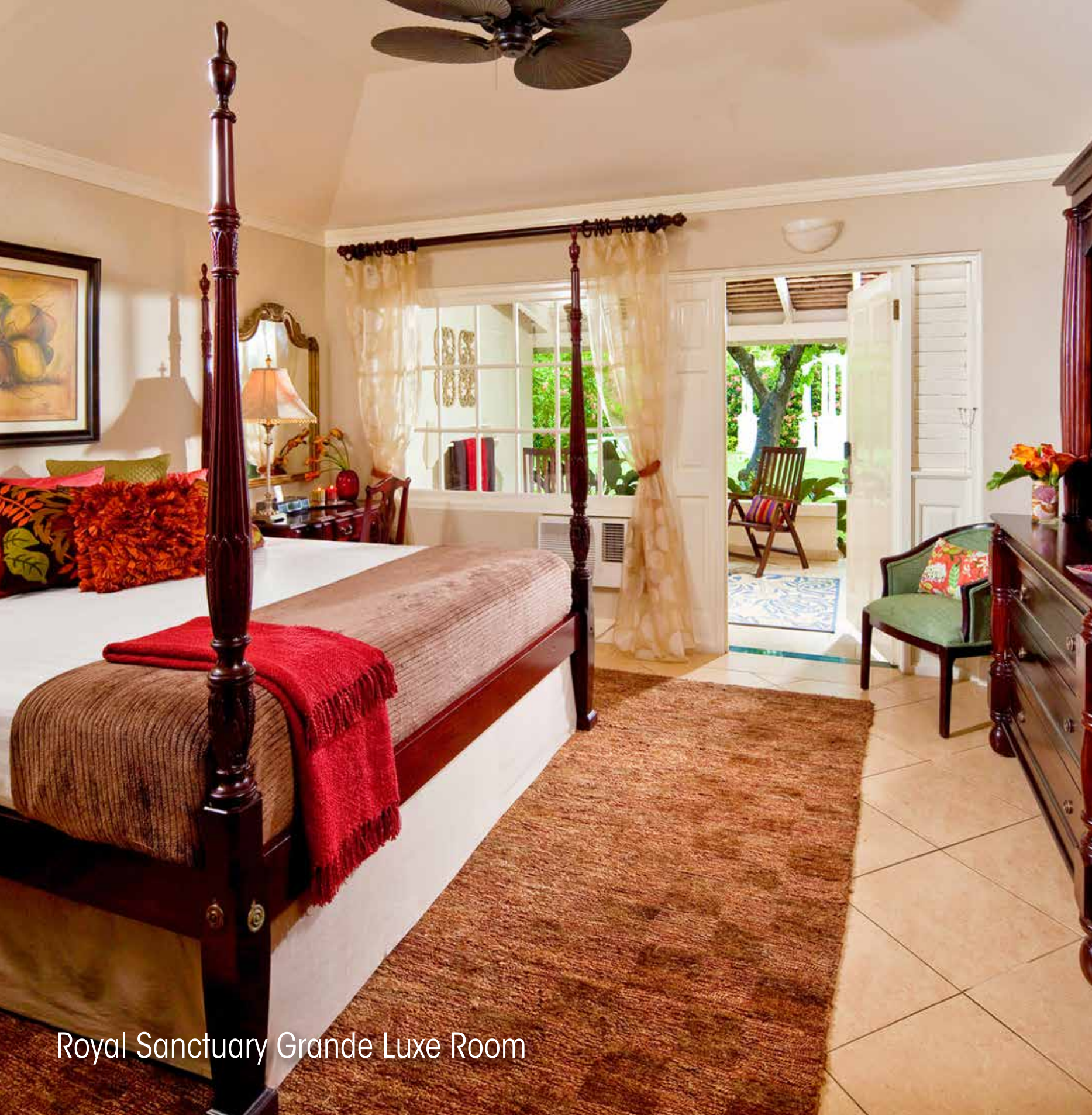
Royal Sanctuary Grande Luxe Room