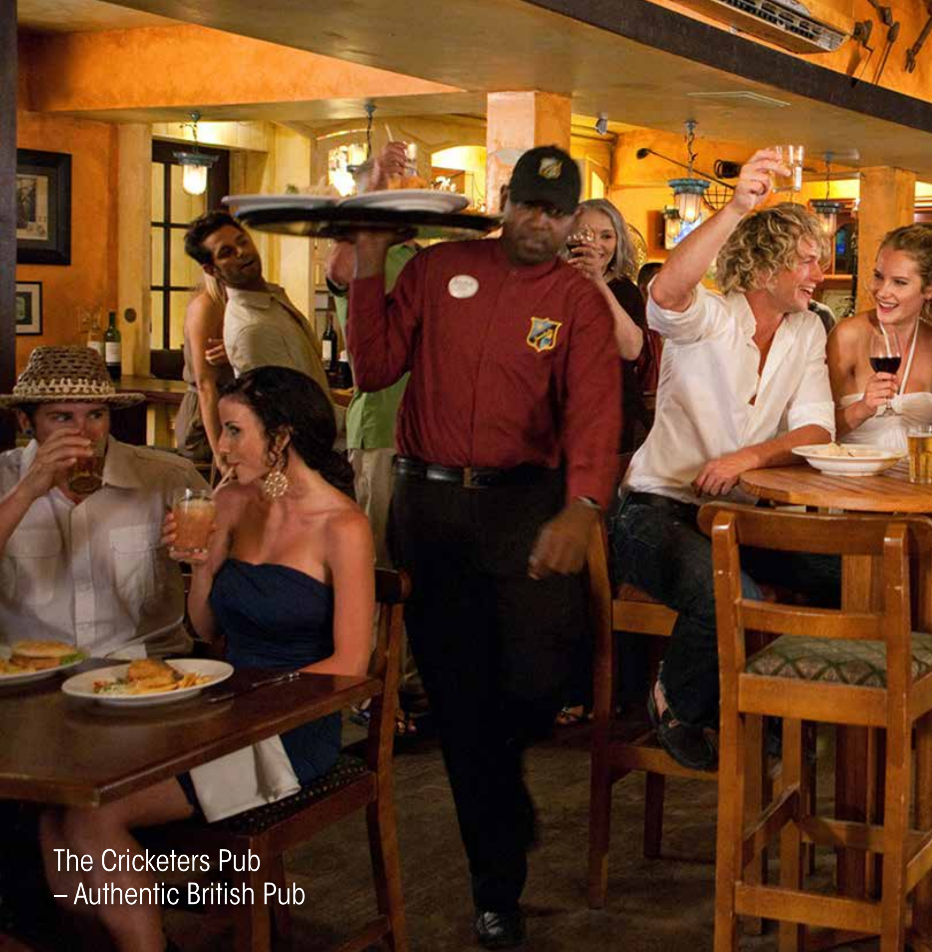
The Cricketers Pub – Authentic British Pub