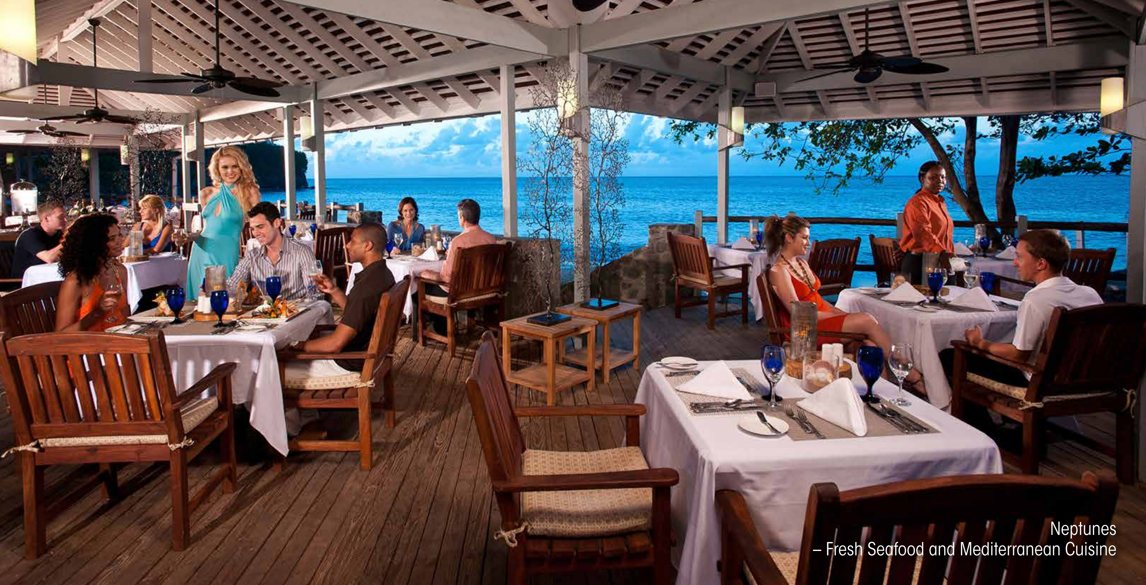
Neptunes – Fresh Seafood and Mediterranean Cuisine