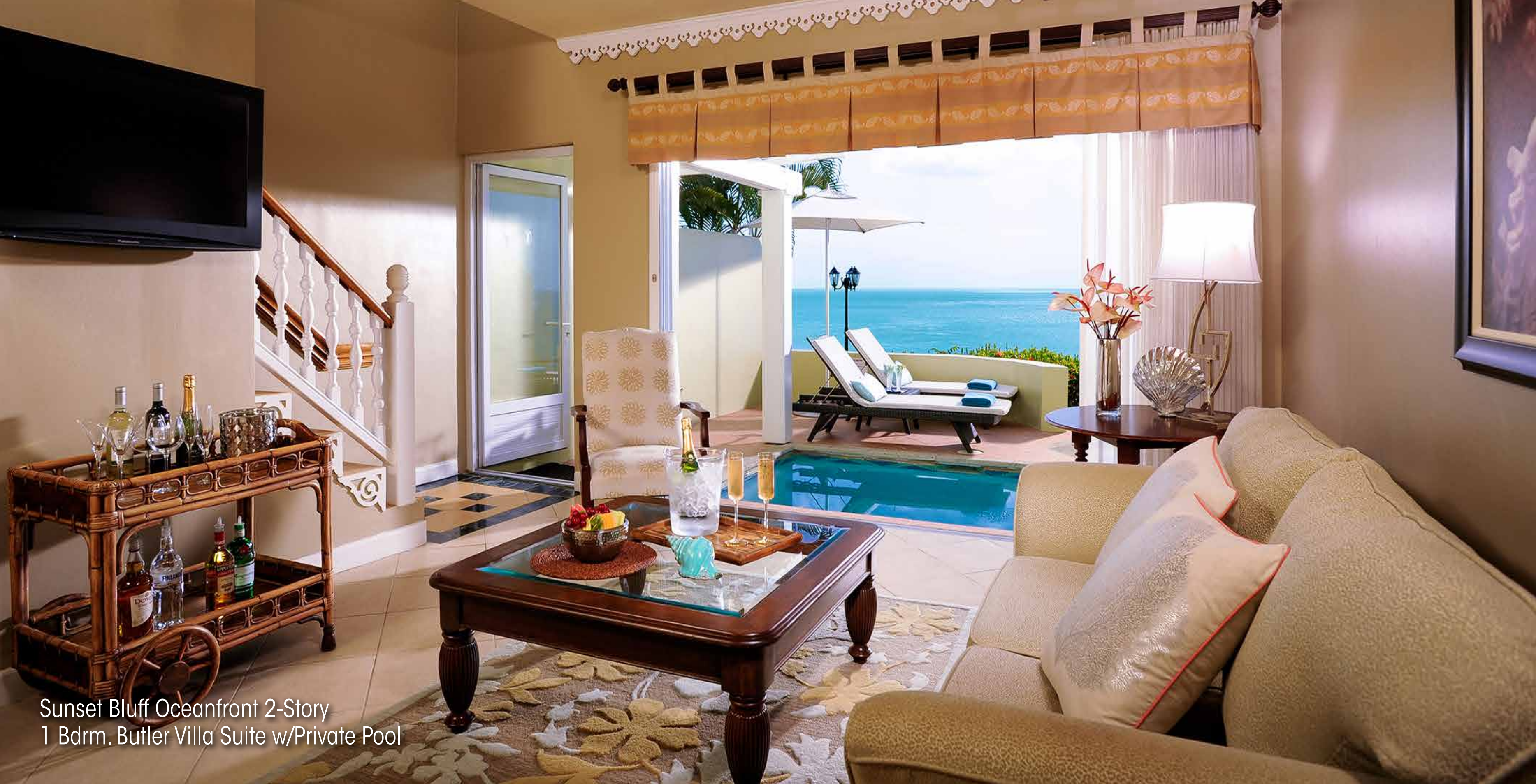
Sunset Bluff Oceanfront 2-Story 1 Bdrm. Butler Villa Suite w/Private Pool