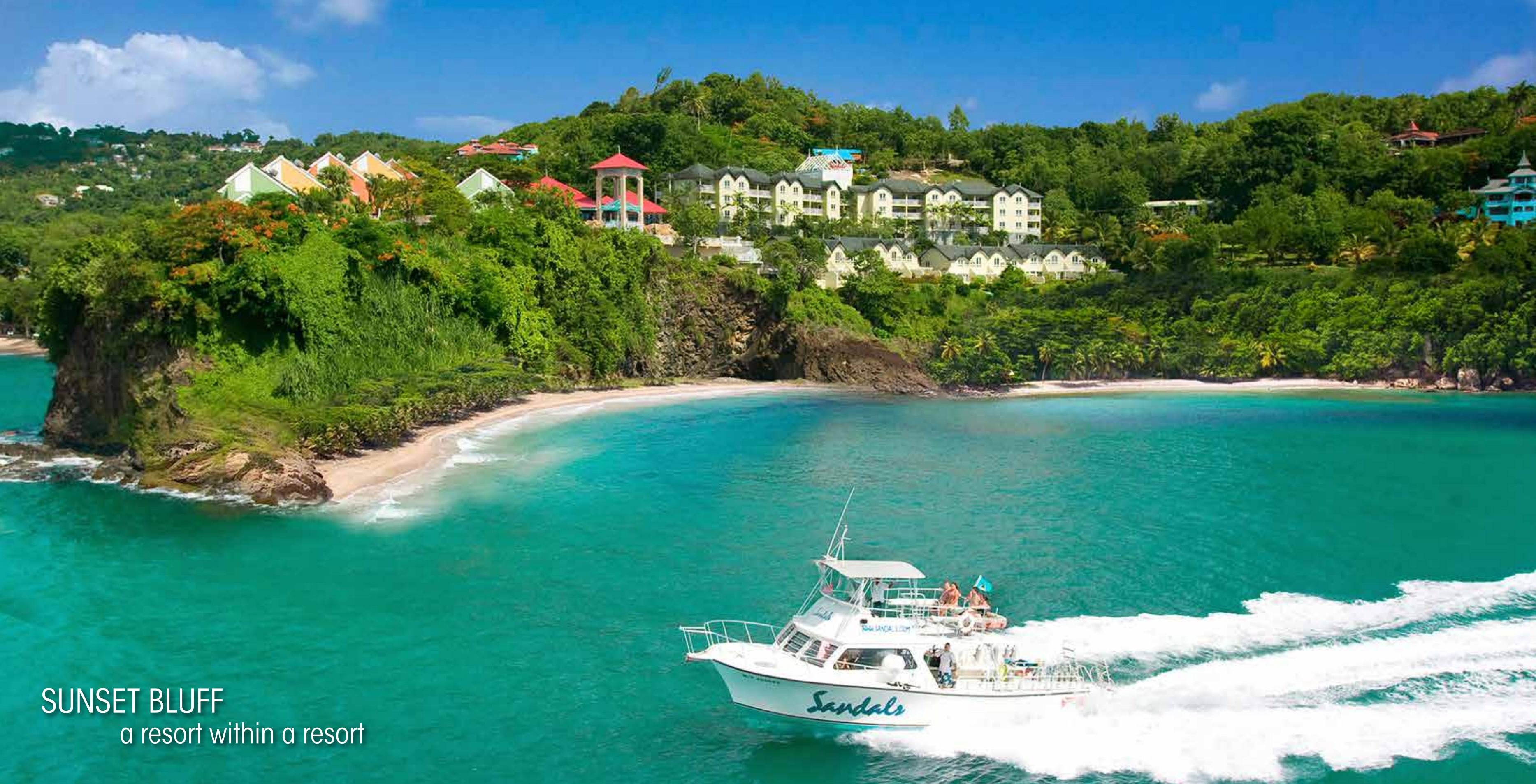
SUNSET BLUFF a resort within a resort