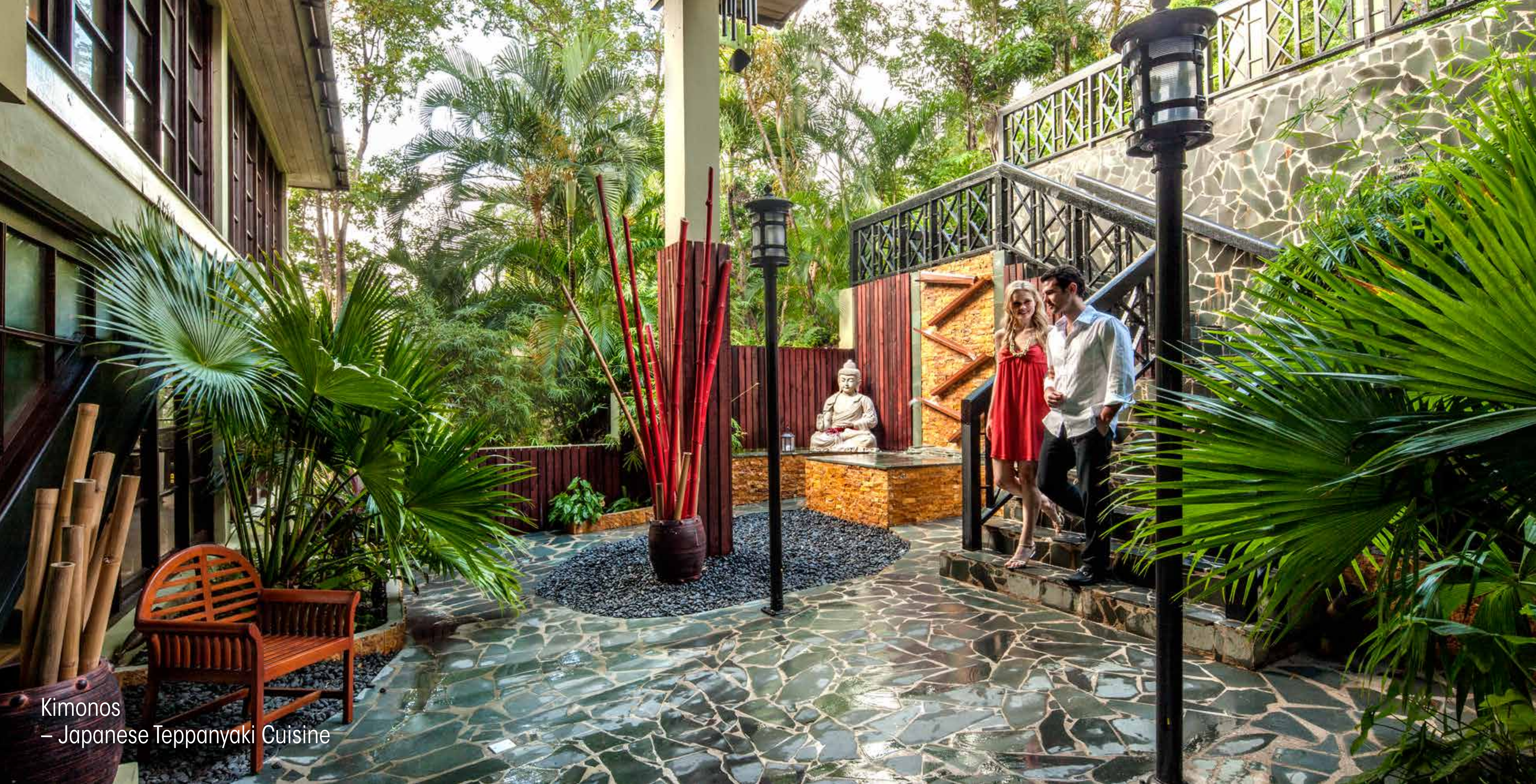
Kimonos – Japanese Teppanyaki Cuisine