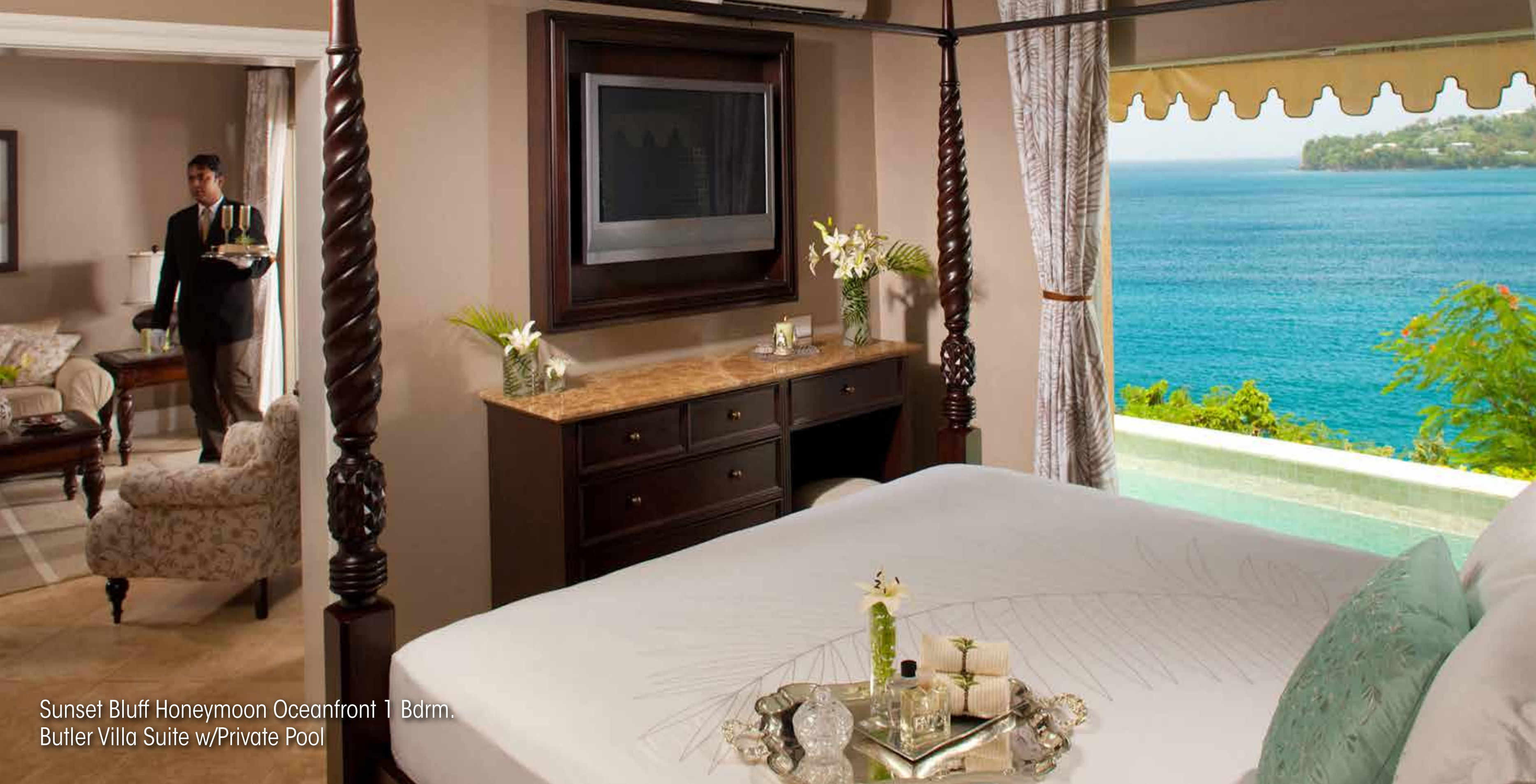
Sunset Bluff Honeymoon Oceanfront 1 Bdrm. Butler Villa Suite w/Private Pool