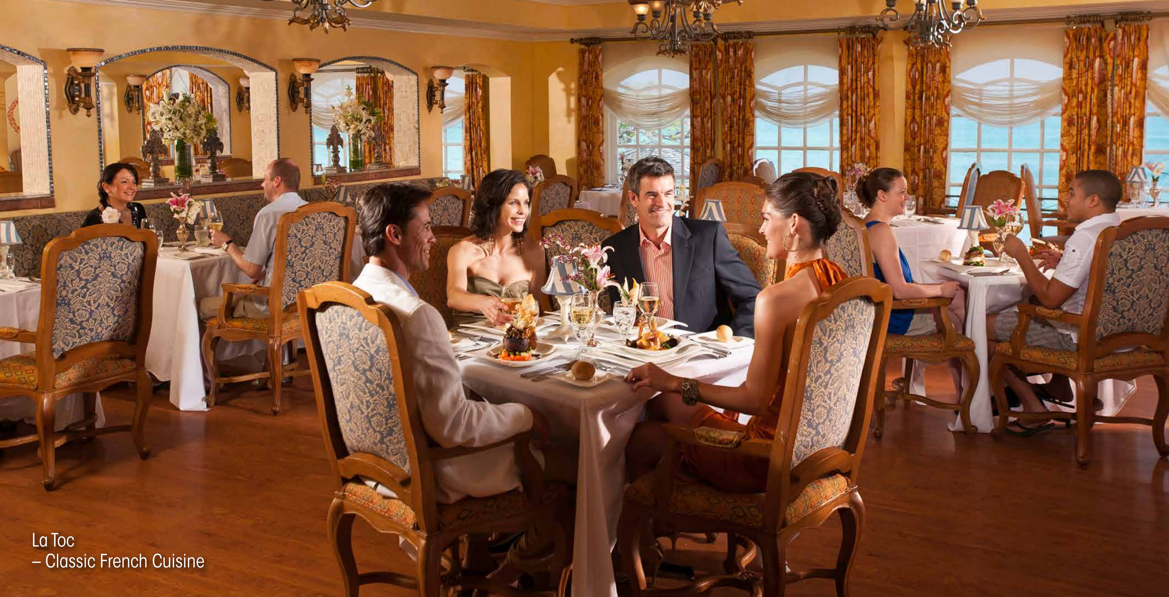
La Toc – Classic French Cuisine