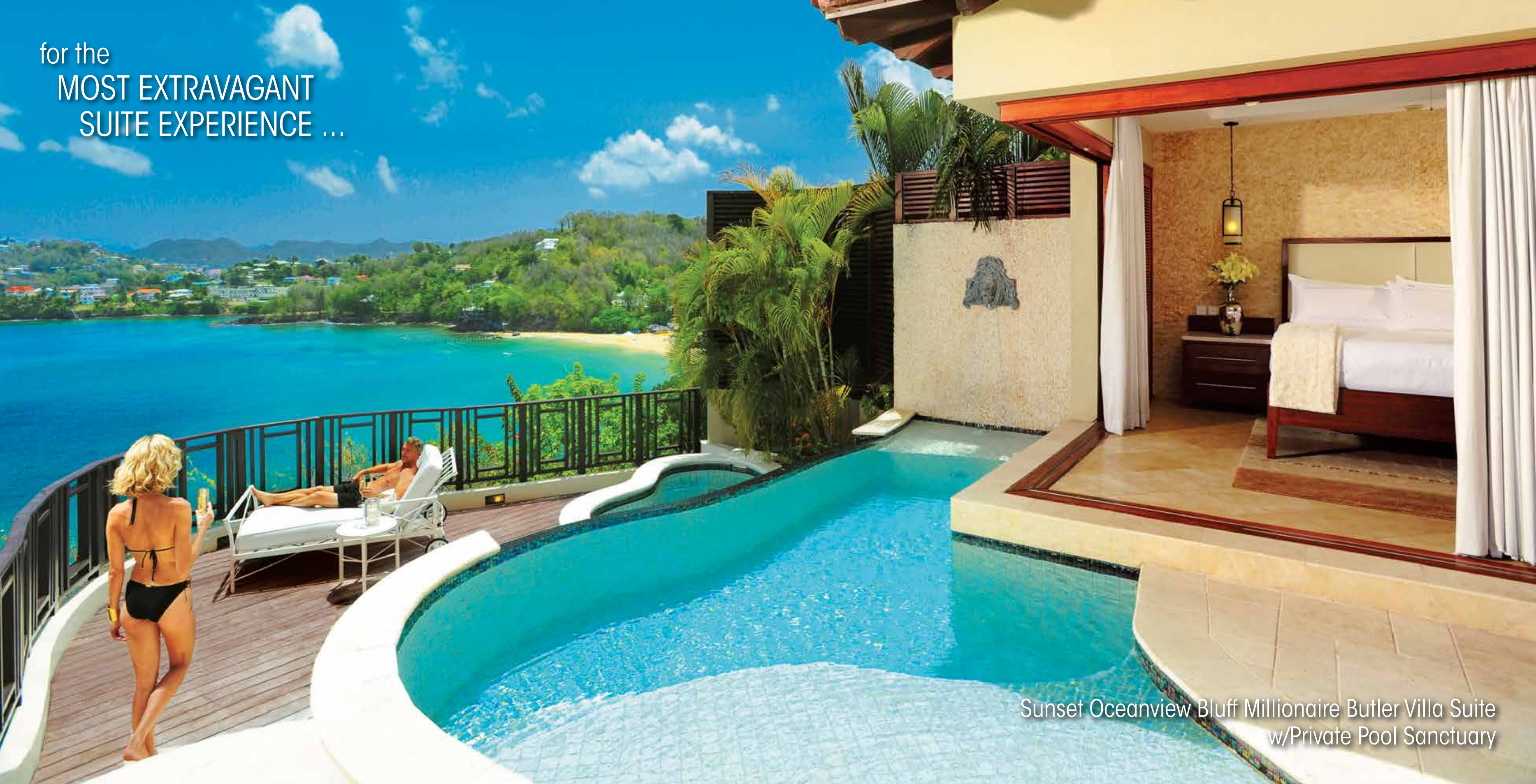
Sunset Oceanview Bluff Millionaire Butler Villa Suite w/Private Pool Sanctuary