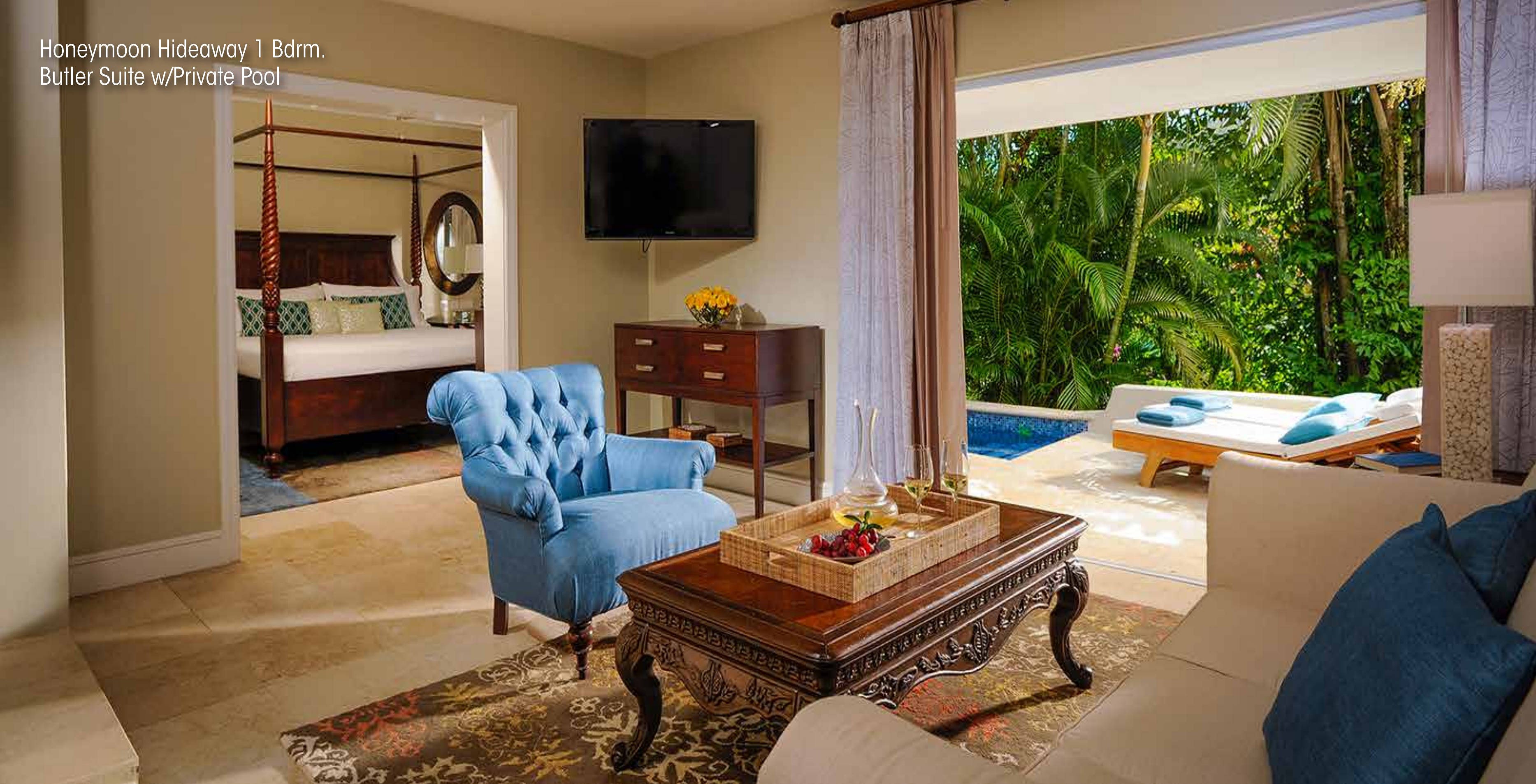
Honeymoon Hideaway 1 Bdrm. Butler Suite w/Private Pool