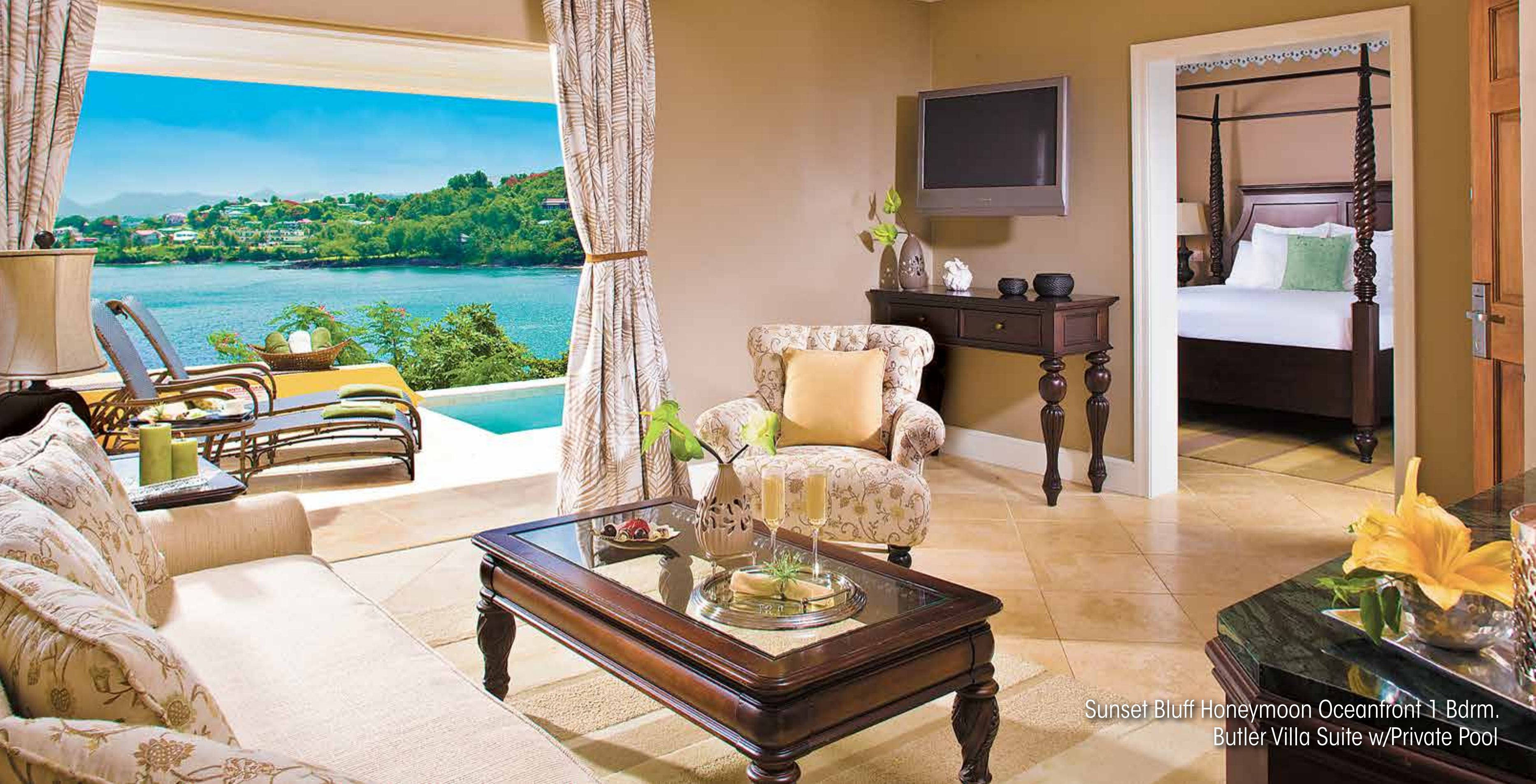
Sunset Bluff Honeymoon Oceanfront 1 Bdrm. Butler Villa Suite w/Private Pool