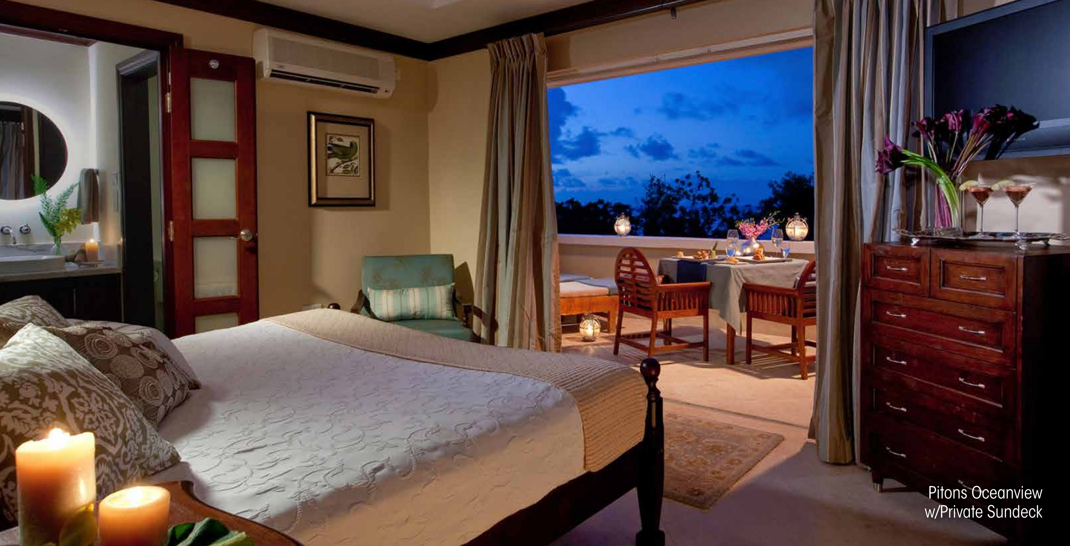
Pitons Oceanview w/Private Sundeck