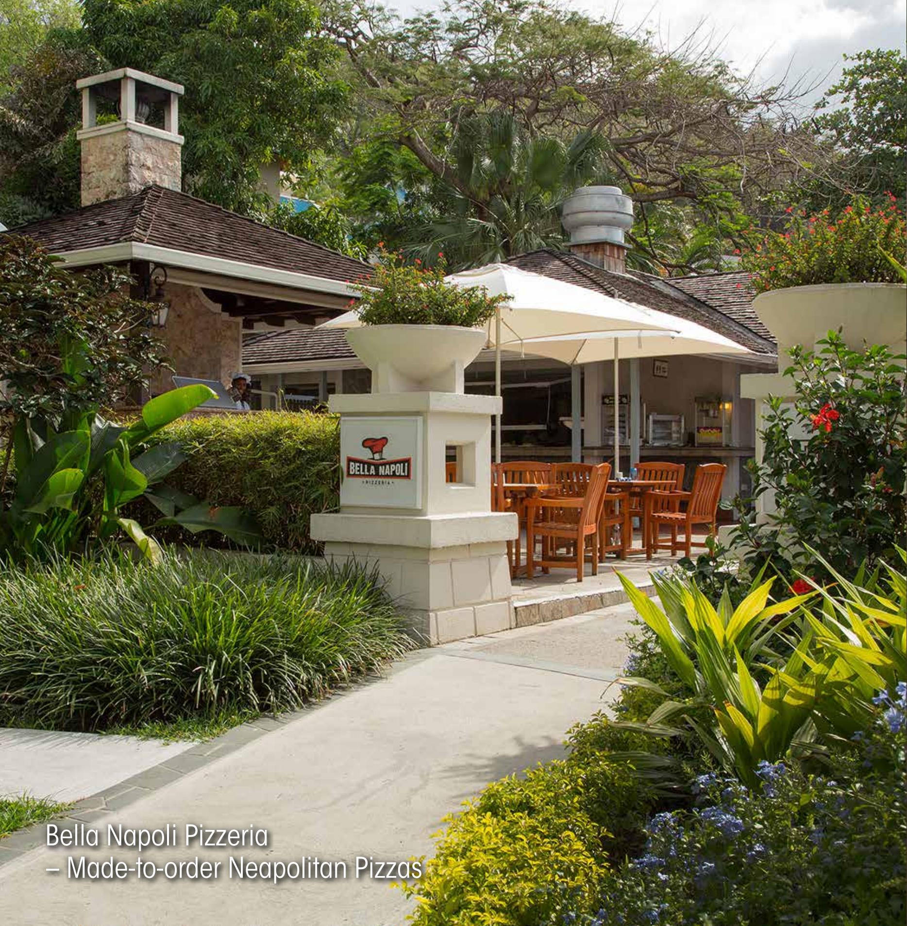
Bella Napoli Pizzeria – Made-to-order Neapolitan Pizzas