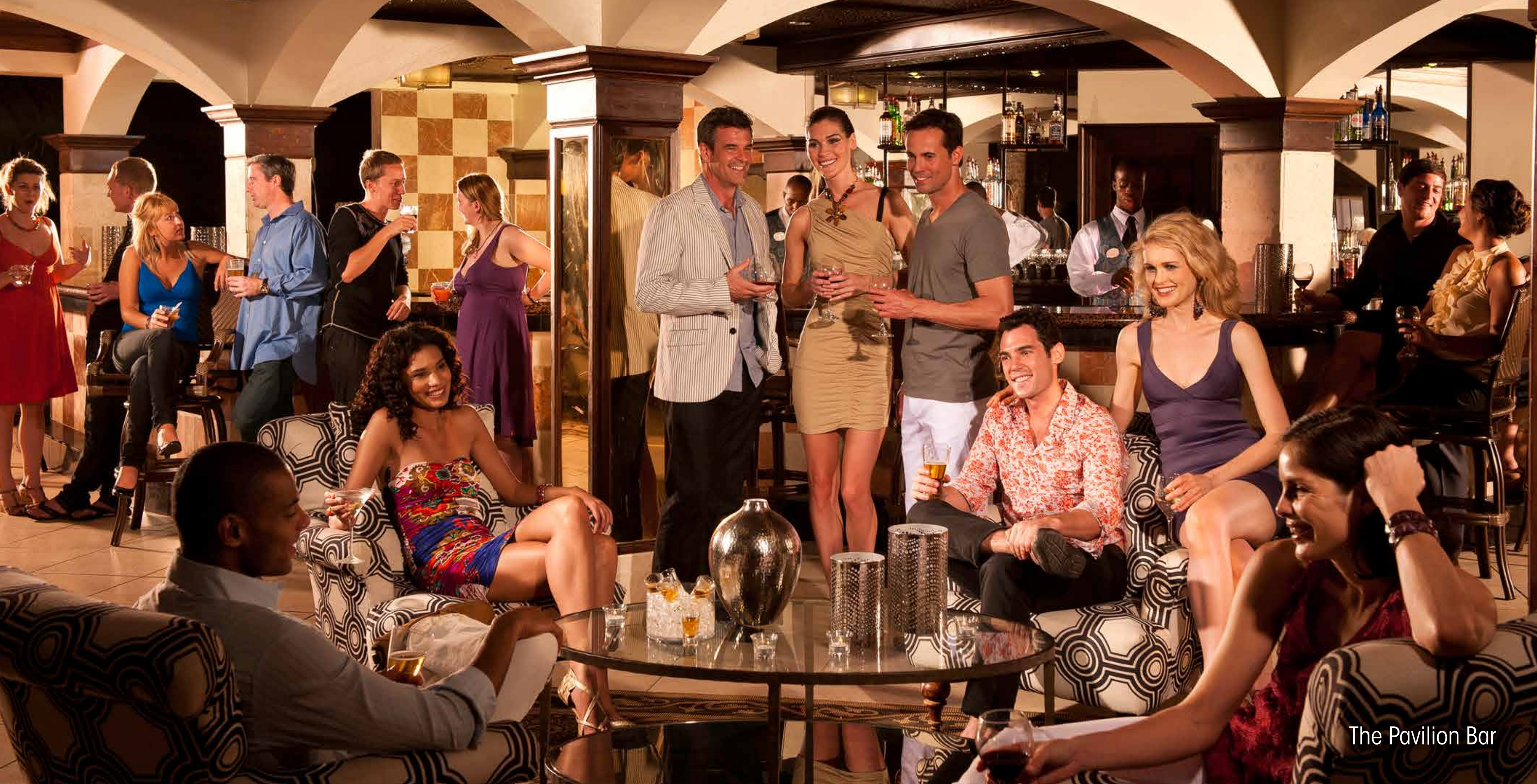
The Pavilion Bar