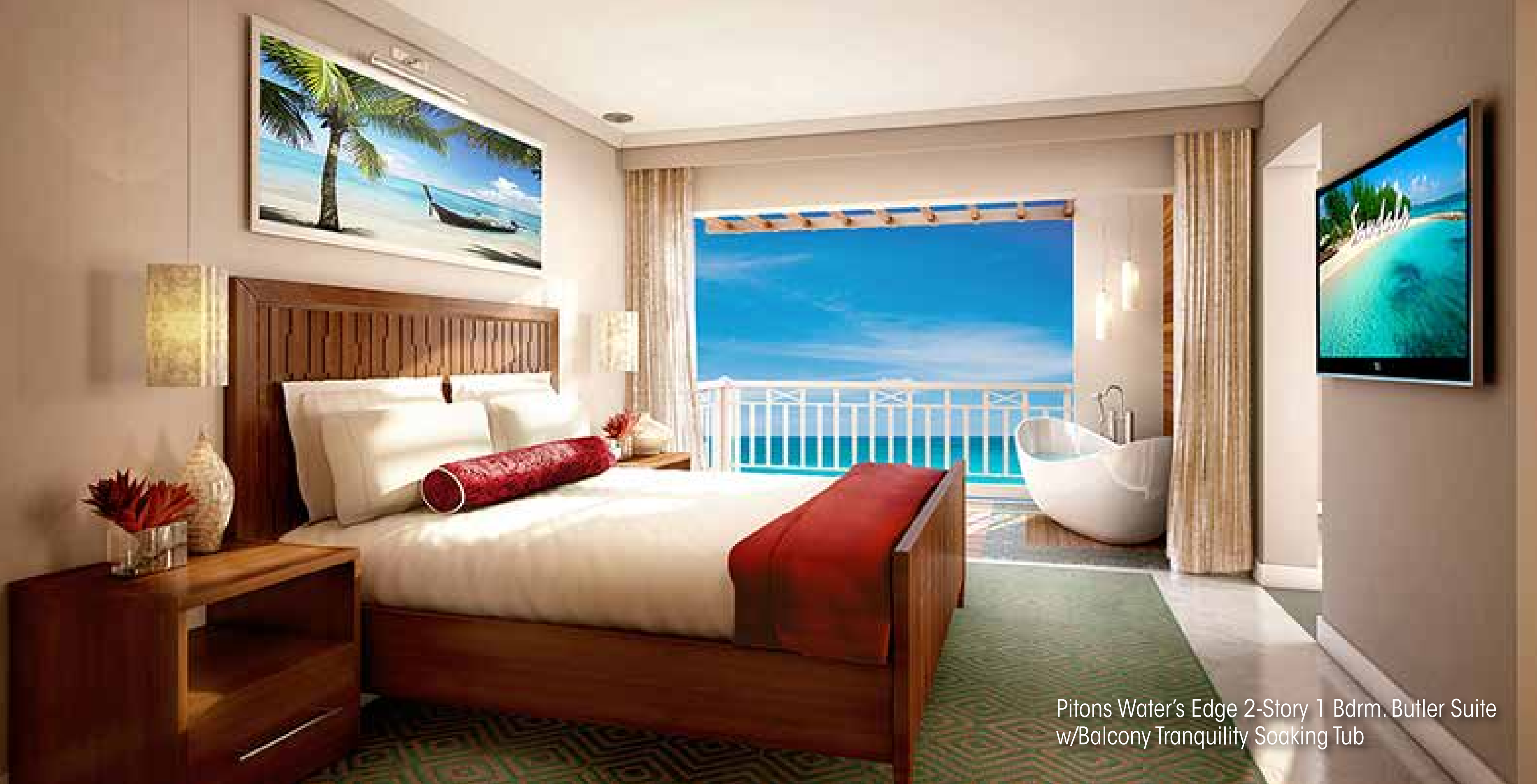
Pitons Water's Edge 2-Story 1 Bdrm. Butler Suite w/Balcony Tranquility Soaking Tub