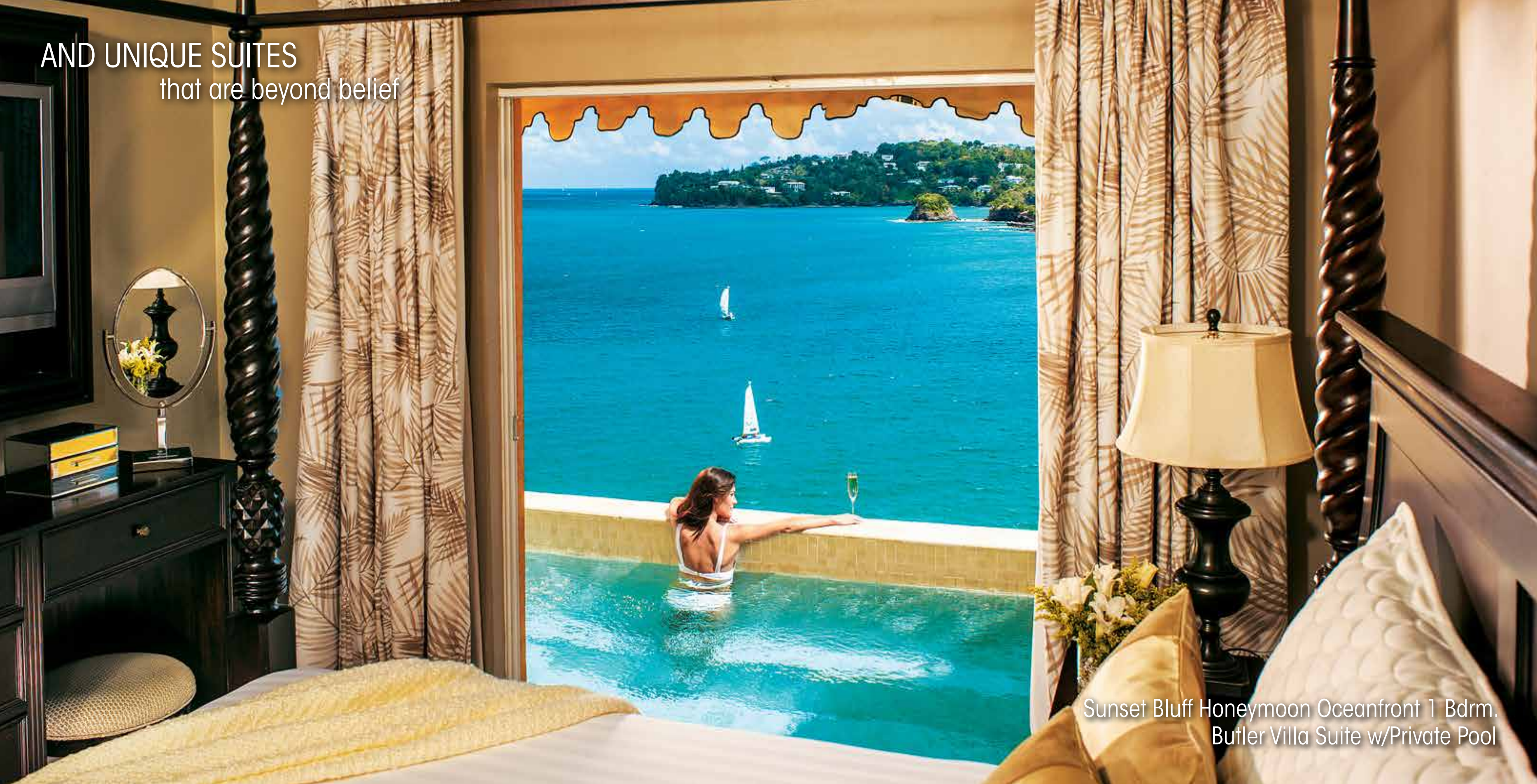
Sunset Bluff Honeymoon Oceanfront 1 Bdrm. Butler Villa Suite w/Private Pool

AND UNIQUE SUITES that are beyond belief