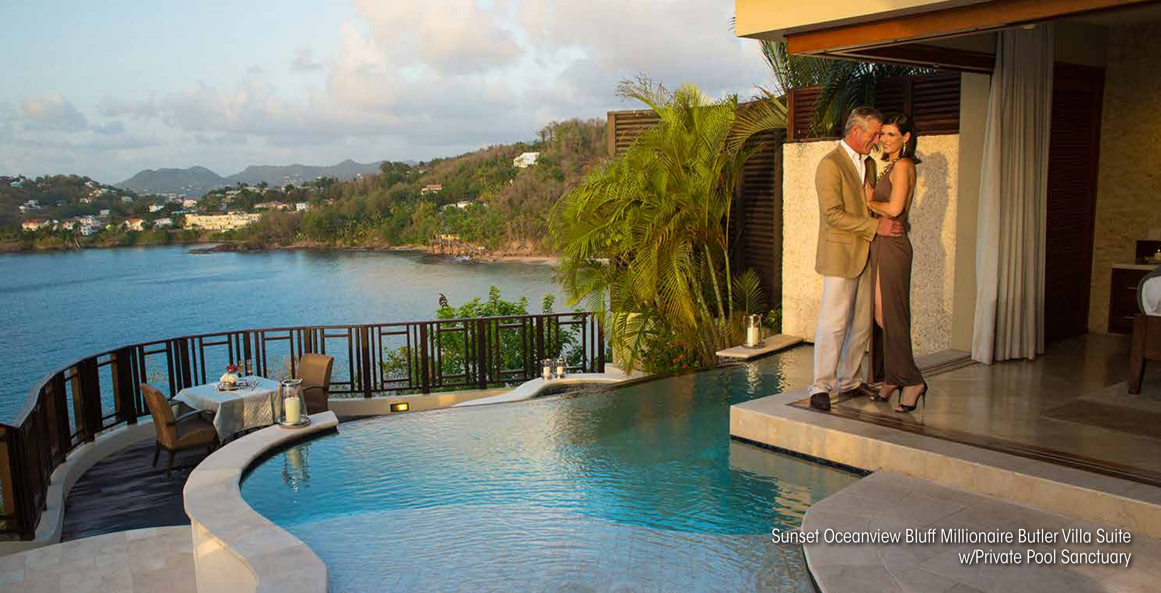
Sunset Oceanview Bluff Millionaire Butler Villa Suite w/Private Pool Sanctuary