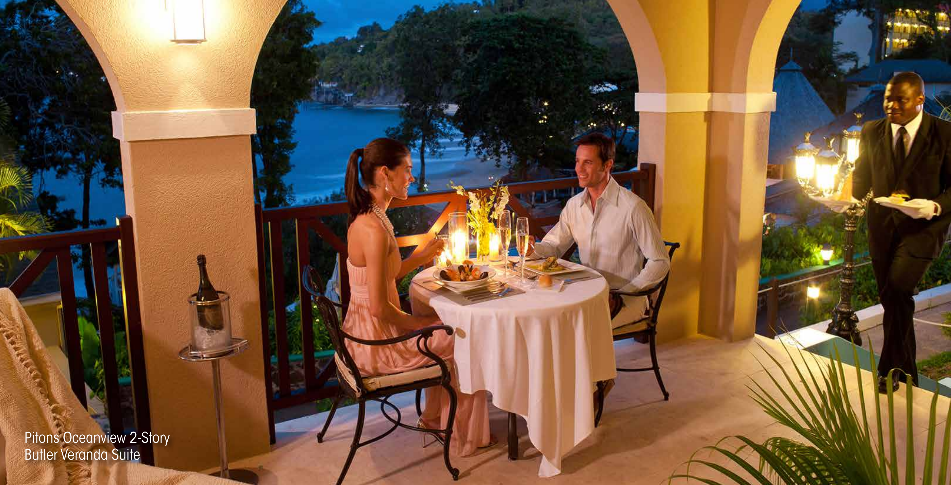
Pitons Oceanview 2-Story Butler Veranda Suite