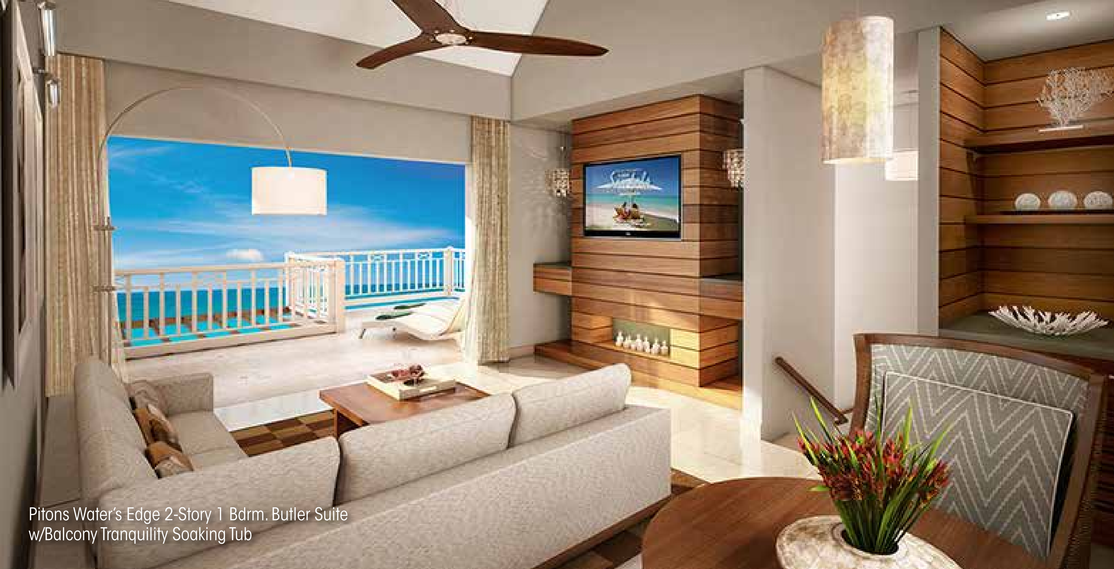
Pitons Water's Edge 2-Story 1 Bdrm. Butler Suite w/Balcony Tranquility Soaking Tub