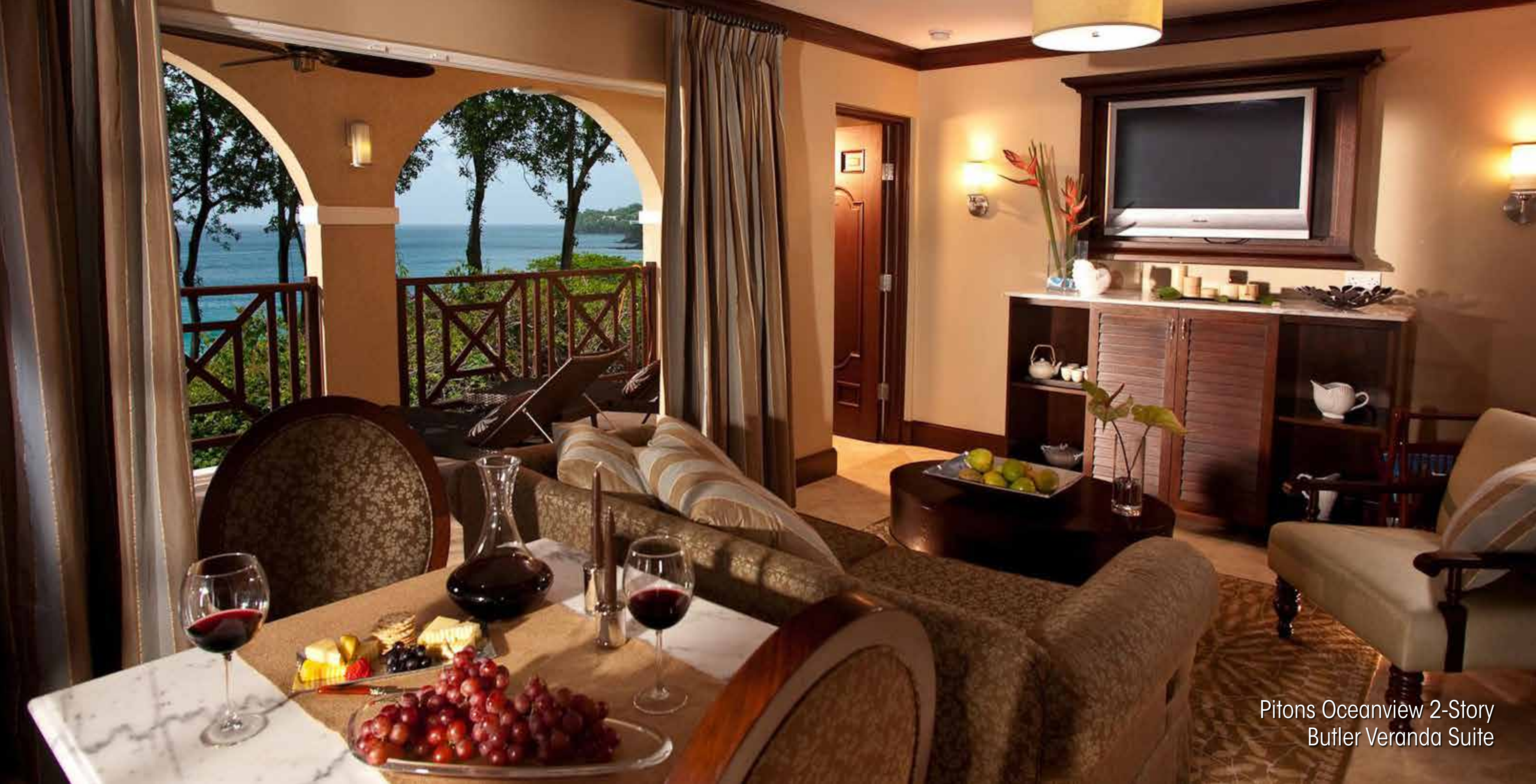
Pitons Oceanview 2-Story Butler Veranda Suite